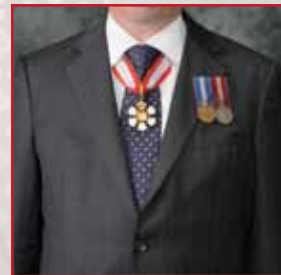
Neck badge and medal bar