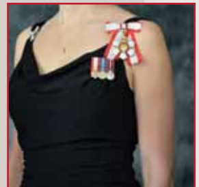
Neck badge on bow and miniatures