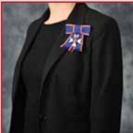
Insignia mounted on bow