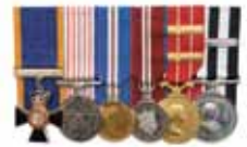
Court Mounting Overlapping Medals