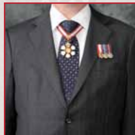
Neck badge and miniatures