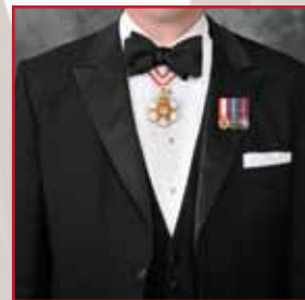
Neck badge and miniatures

Note: the same rules apply to White Tie and Tails.