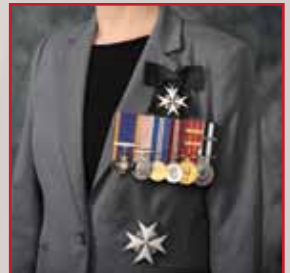
Neck badge on bow with medal bar and breast star