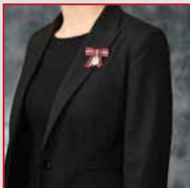
Single miniature on bow