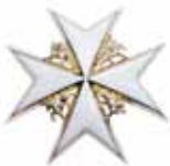
Breast Star: Knight or Dame of Grace of the Order of St. John

Miniatures are smaller replicas of insignia worn on a narrow miniature ribbon for evening functions in place of full-size chest insignia. If more than one miniature is worn, they can be mounted on a medal bar in accordance with the established Order of Precedence. Women with only one miniature may wear it mounted on a miniature bow made from the appropriate ribbon. The miniature bar must include all the miniatures an individual is entitled to wear, including the miniatures of all neck badges or breast stars. The miniature bar is worn in addition to one full-size neck badge (suspended from a miniature ribbon) and a breast star where applicable.