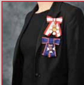
Neck badge and chest insignia mounted on bows