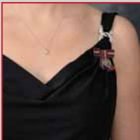
Single miniature on bow