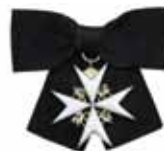
Most Venerable Order of the Hospital of St. John of Jerusalem

Decorations recognize an act of gallantry in combat, or of bravery or meritorious service in a single event or over a specific period of time. The insignia is only awarded once to an individual; if further actions meet the criteria for the same decoration, a bar is awarded and worn on the initial decoration in order to denote a second award.