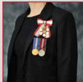
Neck badge on bow and medal bar