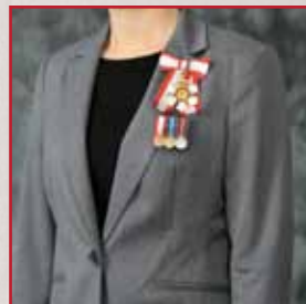
Neck badge on bow and miniatures