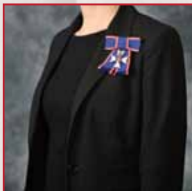
Insignia mounted on bow