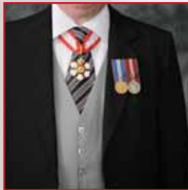
Neck badge and medal bar