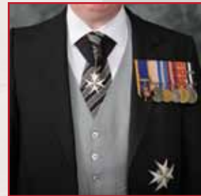
Neck badge with medal bar and breast star