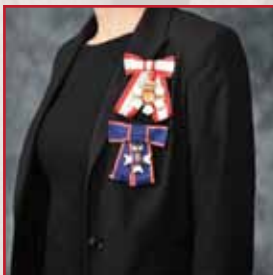
Neck badge and chest insignia mounted on bows