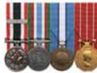
Court Mounting Non-overlapping Medals