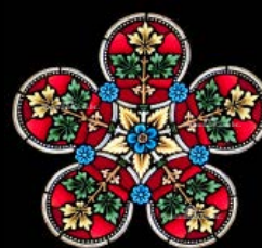
Stained Glass Window 2572: Pretty Rose Window