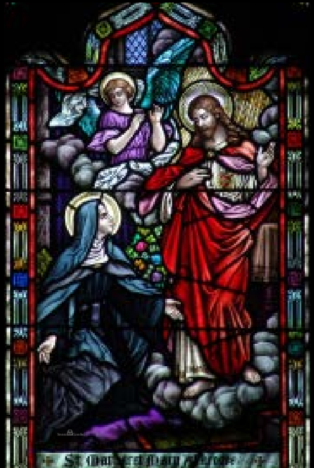
Stained Glass Window 1675- St. Margaret Mary Alacoque

▸ Stained glass windows that depict the Sacred Heart of Jesus depict the physical heart of Jesus to represent His divine love for humanity. This stained glass design is used primarily in the Roman Catholic, Anglo Catholic, and Lutheran Churches. The Sacred Heart is often depicted in stained glass as a flaming heart shining with divine light, as a heart pierced by the lance-wound, surrounded by a crown of thorns, or bearing a cross and bleeding. Sometimes the stained glass image is of Jesus with his wounded hands pointing at the heart. The Sacred Heart stresses the central Christian concept of loving Jesus, the wounds and crown of thorns allude to the manner of Jesus' death, and the fire represents the transformative power of love.