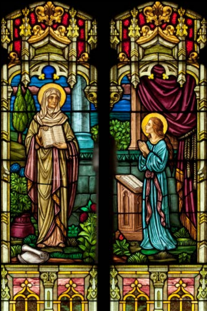
Stained Glass Window 3569: Mary and Scriptures