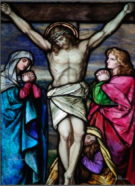
Stained Glass Window 1225: Mourning at the Cross