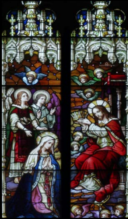
Stained Glass Window 1374: Queen of Heaven