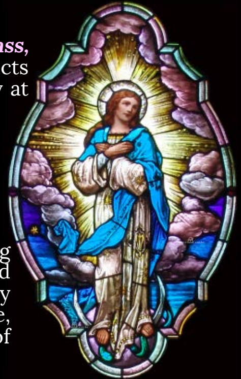
Stained Glass Window 1415: Mary in the Clouds