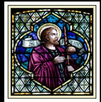
Stained Glass Wndow 1467: St. James

We are always happy to work with your church or organization to produce custom stained glass artwork commemorating a particular saint or event.