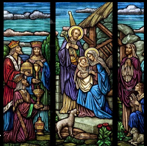
Stained Glass Window 3570: The Nativity of Jesus