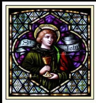
Stained Glass Wndow 1464: Saint John with Chalice