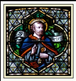
Stained Glass Wndow 1459: Square St. Peter Window