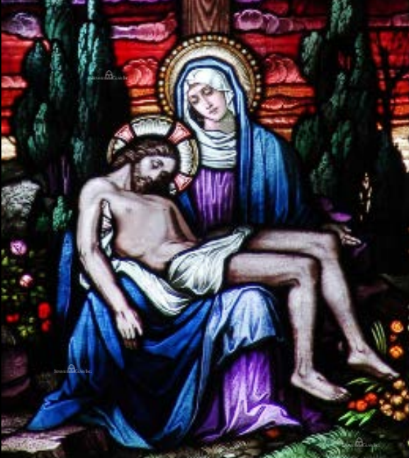
Stained Glass Wndow 1287: Holy Mother Cradling Child