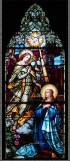
Stained Glass Window 4460: Mother of Christ