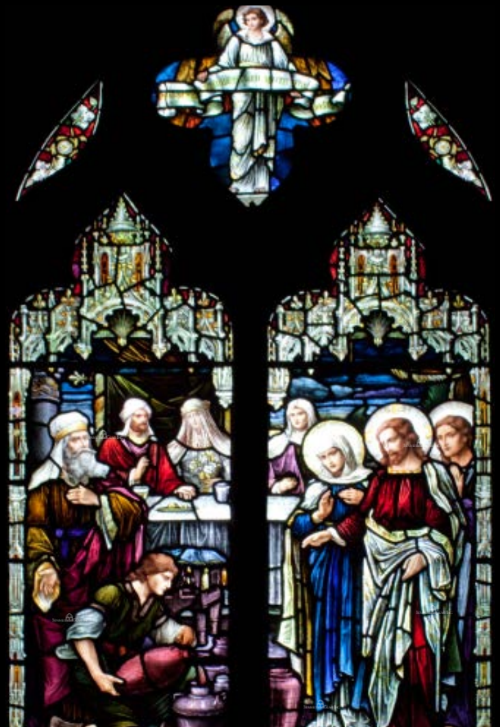
Stained Glass Window 2091: Water to Wedding Wine

POPE JOHN PAUL POINTED OUT THAT THROUGH STAINED GLASS AND OTHER TYPES OF CATHOLIC ART “THE KNOWLEDGE OF GOD CAN BE BETTER REVEALED AND THE PREACHING OF THE GOSPEL CAN BECOME CLEARER TO THE HUMAN MIND”.