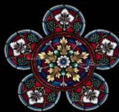
Stained Glass Window 2571: Leaves and Grapes