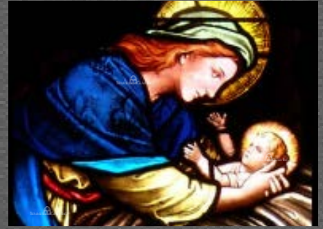
Stained Glass Wndow 5534: Holy Mother Cradling Child