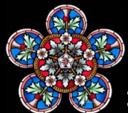
Stained Glass Window 2570: Leaves and Flowers