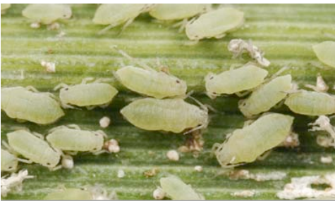
Aphids, Suborder Sternorrhyncha