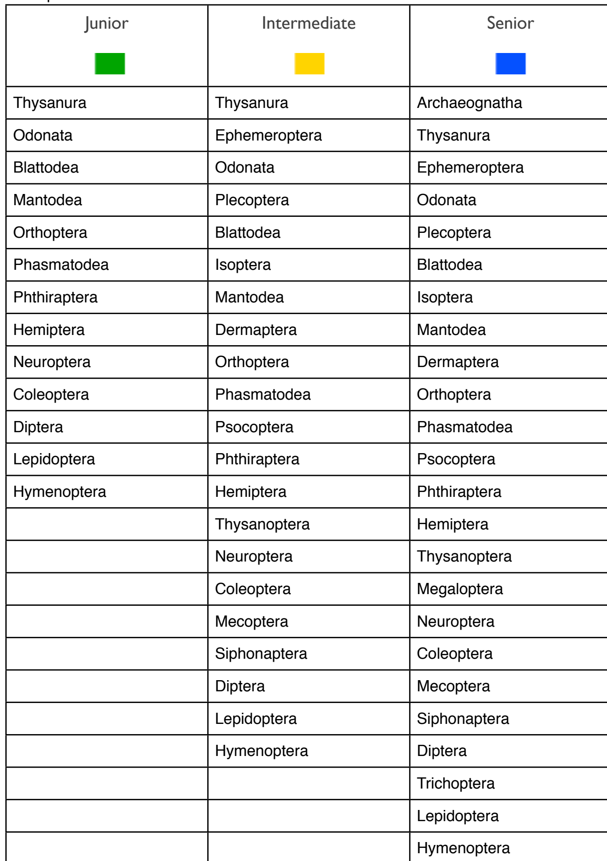
Table 1. 4-H Level and List of Required Insect Orders. Older groups of learners are responsible for all material presented to younger groups. Color bars are repeated on the descriptions of insect orders.