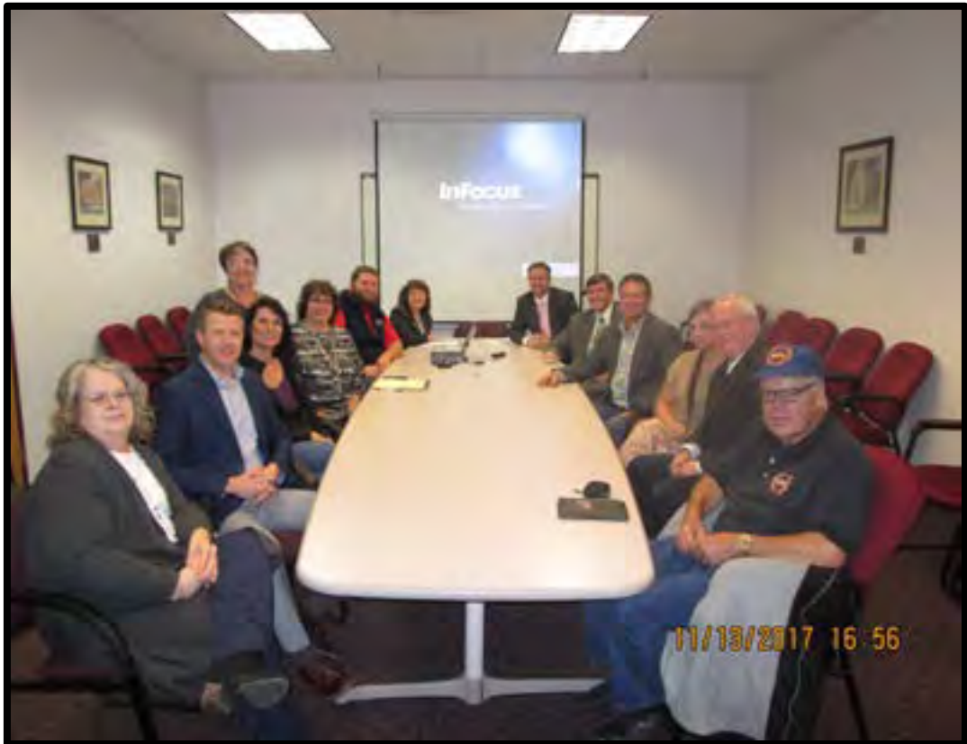
Pocatello, Idaho Community "Save the Plant" Coalition 2017

Recruit early, find support with some union members but also representatives that work for the community. Look at partners, businesses, and mailers that you want at your Town Hall. Especially those organizations and businesses who depend on the services the Postal Service provides.