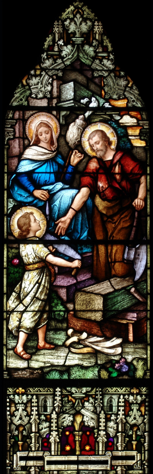
Scene from Christ's Youth

Imagine your church with new stained glass windows. As the light filters through the stained glass images the brilliantly colored and textured windows express symbolically the essence of the message. Since the earliest days of the Church, stained glass has been used in Lutheran churches. Martin Luther appreciated art and valued its use as an aid to religious devotion. In keeping with those teachings, the Lutheran Church has a long history of beautiful religious art and imagery.