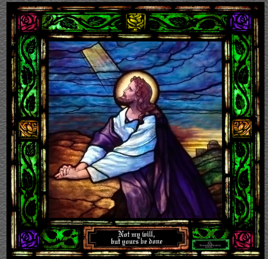
“Not my will, but yours be done.” Luke 22:42 Panel #4057