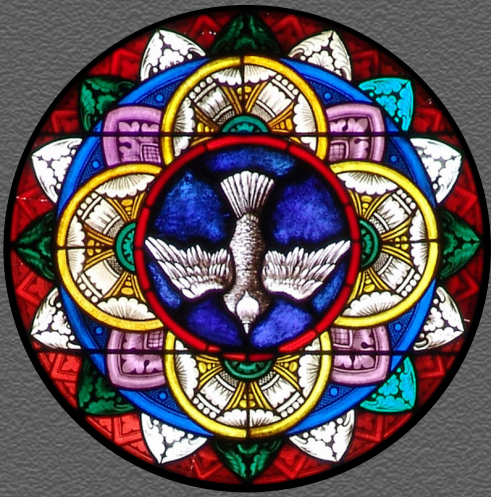
Round Stained Glass Medallion with the Holy Spirit Symbolized as a Dove Panel #5075