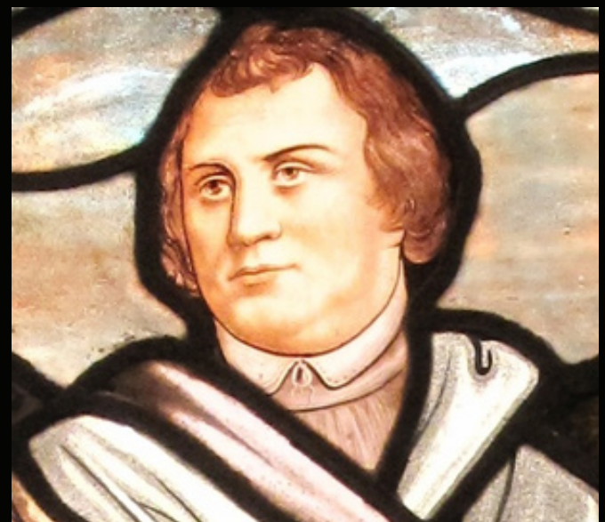
Martin Luther in Stained Glass

Stained glass windows featuring Martin Luther or events from the history of the Lutheran Church are also available.