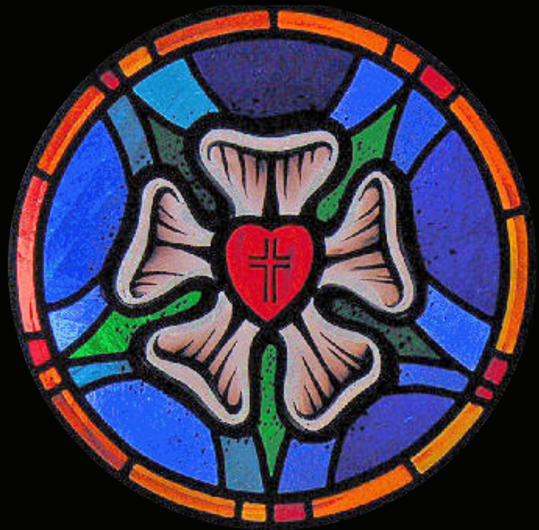
Stained Glass of Luther's Rose, a symbol of the Lutheran Church

It dates to 1520, when the printers asked Luther to tell them what symbol they could put on publications to indicate they were authorized publications of Luther's works. Luther described the seal and created a personal symbol to summarize his faith. The seal features a cross on a red heart set in a white rose. More images of symbolic stained glass.