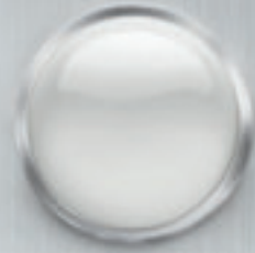
CLEAR WHITE (LX) YOU ARE OPEN TO EXPLORING ENDLESS POSSIBILITIES. YOUR GLASS IS ALWAYS HALF-FULL.

Actual colors may vary from printed brochure. See kia.com/sportage for interior combinations.