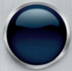
PACIFIC BLUE (LX, EX, SX) A WAVE OF CALM WASHES OVER YOU AS YOU REALIZE, YES, THIS IS DEFINITELY THE COLOR FOR YOU.

Find out which COLOR is your perfect match