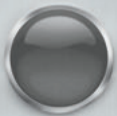
MINERAL SILVER (LX, EX, SX) THOUGH YOU HAVE A SPARKLING PERSONALITY, YOUR SOUL REMAINS SALT-OF-THE-EARTH.