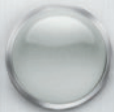
SPARKLING SILVER (LX, EX, SX) YOU NOTICE THE SUBTLE IRONIES IN LIFE. NOTHING IS EVER BLACK AND WHITE TO YOU.