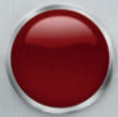
HYPER RED (LX, EX, SX) YOU CRAVE EXCITEMENT, AND YOUR POSITIVE ENERGY IS DOWNRIGHT CONTAGIOUS.