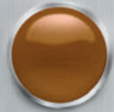
BURNISHED COPPER (LX, EX, SX) YOU HAVE A WARM Demeanor AND ALWAYS APPEAR POLISHED WHEN THE SITUATION CALLS FOR IT.

Find out which COLOR is your perfect match