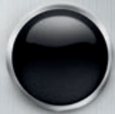
BLACK CHERRY (LX, EX, SX) YOUR SWEET NATURE IS SOMETIMES BELIED BY YOUR LOVE OF DARK COMEDIES.