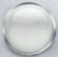
SNOW WHITE PEARL (EX, SX) YOU HAVE A PURE HEART AND GENTLE NATURE. YOU LOVE LONG NAPS.