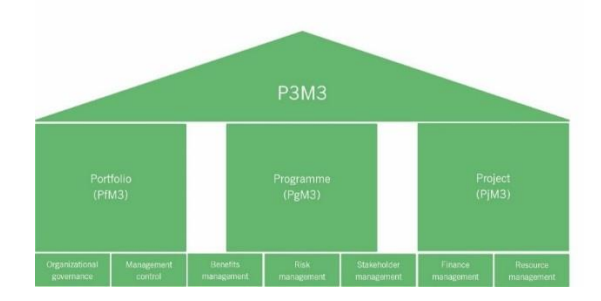
Copyright © AXELOS Limited 2016. Used under permission of AXELOS Limited. All rights reserved.

Where possible also reference the full source of the text, diagram or table (title of publication, page number etc.), as detailed below: