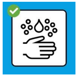
Wash your hands thoroughly