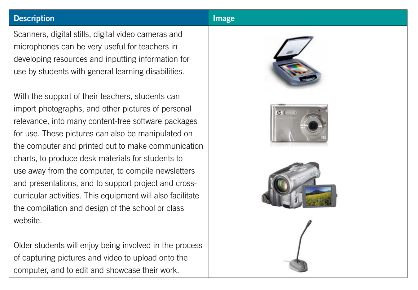
Table 7. Scanners, digital video cameras and microphones

In addition to the input devices discussed above, some students with general learning disabilities may need to use some form of alternative and augmentative communication (AAC) . ACC refers to ways (other than speech) that are used to send a message from one person to another. We all use augmentative communication techniques, such as facial expressions, gestures, and writing, as part of our daily lives. In difficult listening situations (noisy rooms, for example), we tend to augment our words with even more gestures and exaggerated facial expressions.