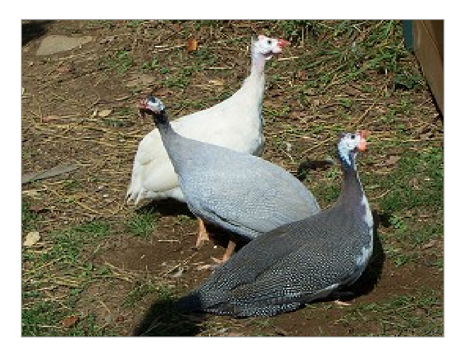
Figure 2 Varieties of guinea fowls

Guineas have been domesticated for many years; they were raised as table birds by the ancient Greeks and Romans. They were brought to the United States by the early settlers. Figure 2 shows some varieties of guinea fowls.