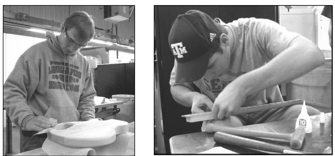
Students in the TEC course work on sanding the guitar body and installing frets.

The students finish the guitar body, cut and finish the head, assemble and solder the electronics following a schematic, install the electronics, and assemble the guitar.