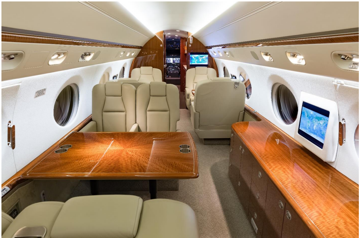
Mid Cabin looking Forward