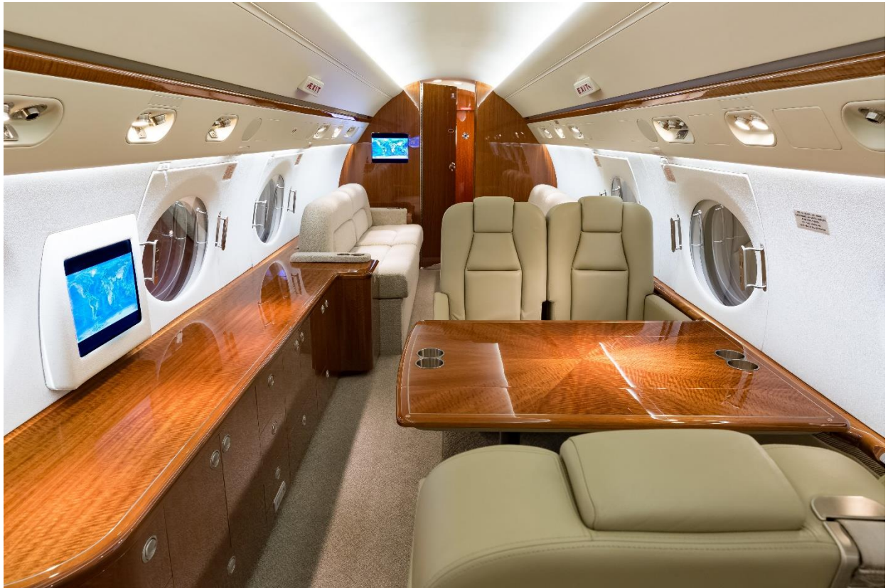
Mid Cabin looking Aft