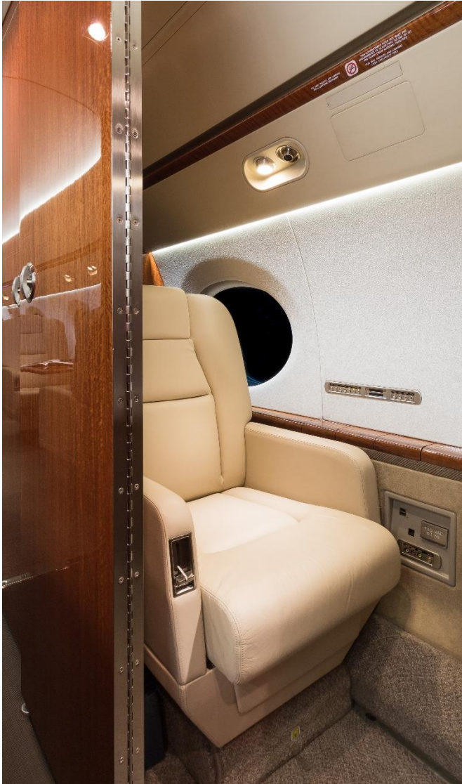
Forward Crew Rest