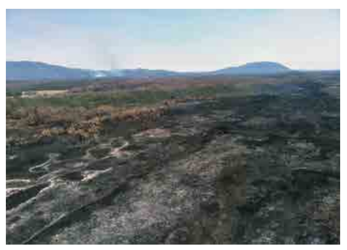
Impact of natural disaster on habitat: Crowdy Bay National Park after the Black Summer bushfires.