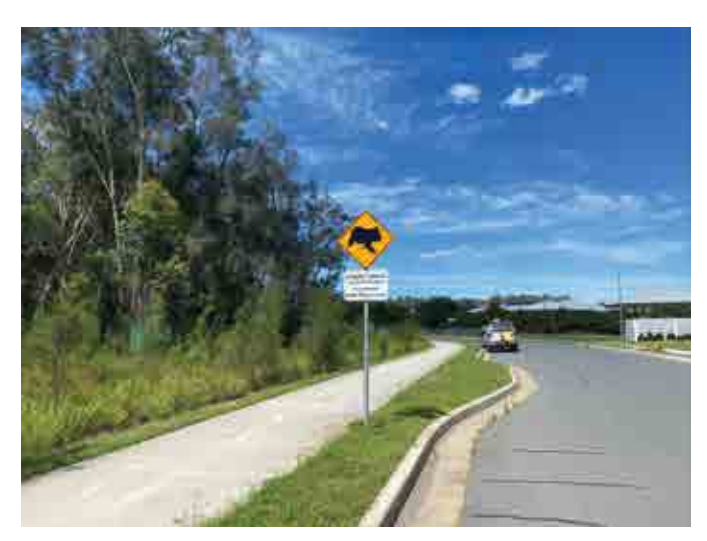
New human homes abutting koala habitat.