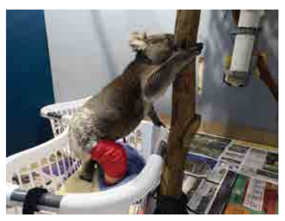
In ICU Timothy climbs up into the safety of his gunyah following a treatment in the clinic.