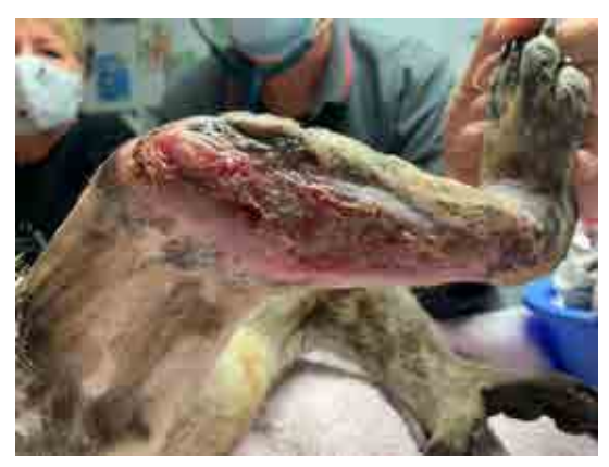
Timothy's leg in the early stage of healing.