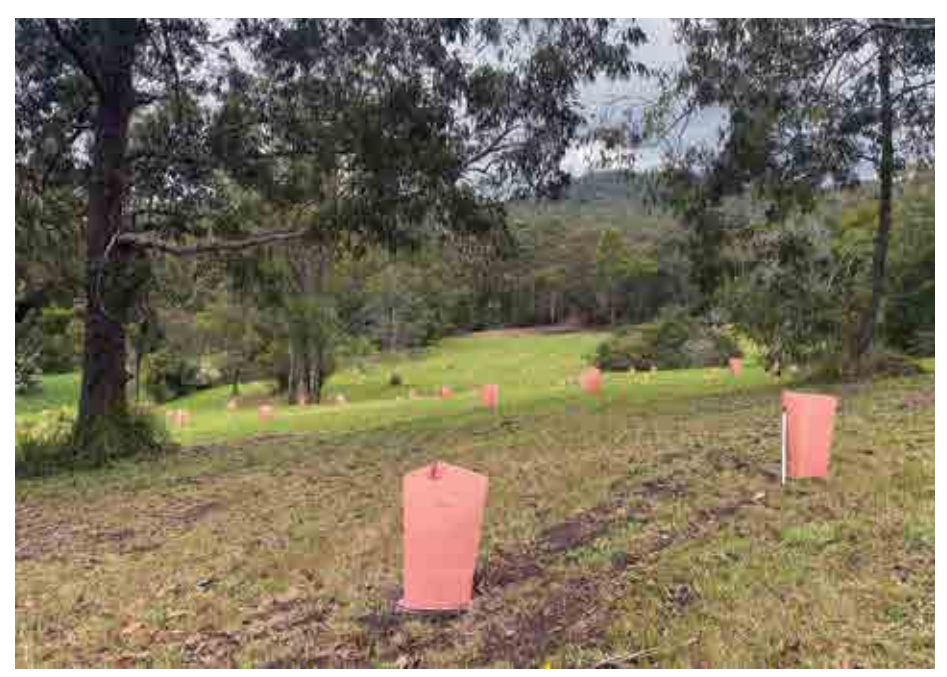
Young koala food trees at Moripo, protected by tree guards. Trees are planted following the contours of the land using 'keyline' ploughing.