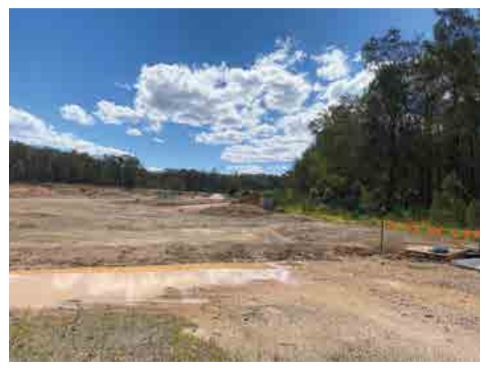
Human impact on habitat.

In many parts of Australia, koala numbers have been declining for decades, and in 2012 the species was listed as vulnerable in some states. Prolonged drought conditions followed by the devastating bushfires of 2019/2020 severely impacted wild populations, and many conservation groups are campaigning for koalas to be further recognised as endangered.