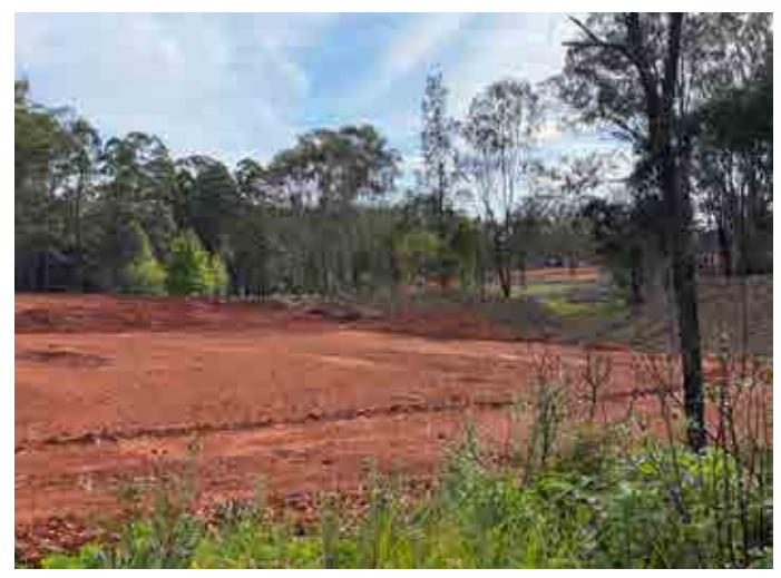
Wildlife sanctuary cleared for development.

The timelines for the plan recognize the need for speed, the increasing effect of climate change and continued fragmentation and degradation of koala habitat. The plan focusses on minimizing, stopping or offsetting further habitat loss, and reducing physical barriers to the safe movement of koalas such as disruption of wildlife corridors and fencing of land. This will be supported by the mapping and identifying of existing habitat, improving its condition on both