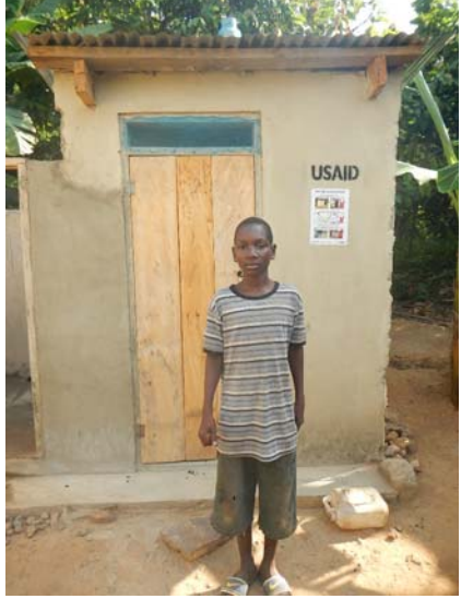
Household latrine beneficiary who received a partial subsidy stands in front of to his family's completed latrine.