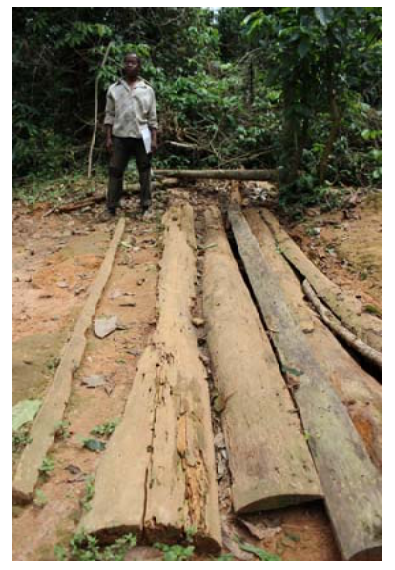
In Asafo Pechi, residents continue to use the traditional pit latrine shown here. The community failed its ODF assessment in 2013.

• The project strategy focused on achieving deliverables (household latrine construction targets) rather than assisting communities in achieving ODF. Attention was given to the ODF target on the project at a very late hour, and these objectives also impacted communities' own objectives – many also focused on getting household latrine without fully appreciating the role of ODF in improving the sanitation situation in their environment.