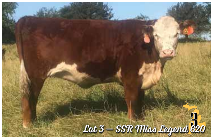
Lot 3 — SSR Miss Legend 620