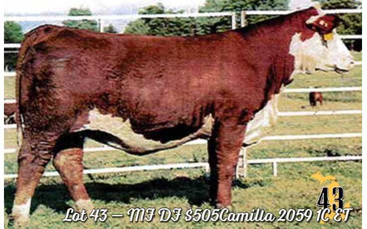
Lot 43 - MJ DJ R505 Camilla 2059 1C ET