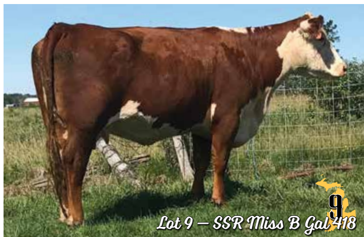
Lot 9 — SSR Miss B Gal 418