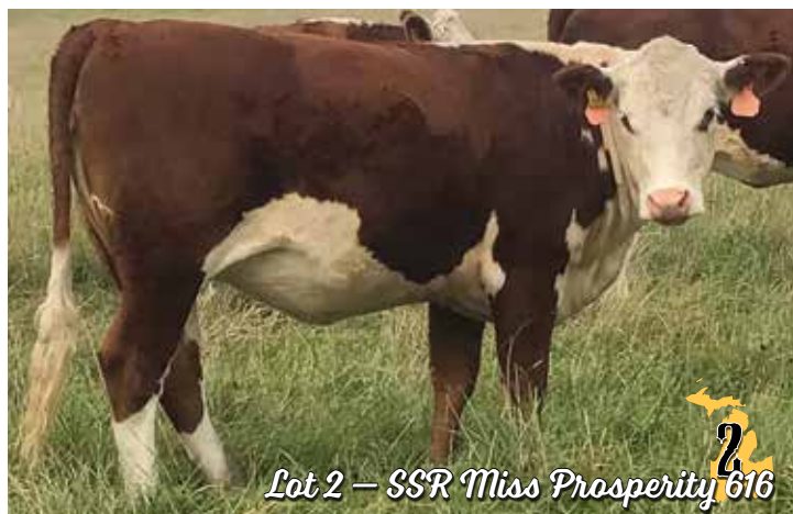
Lot 2 — SSR Miss Prosperity 616