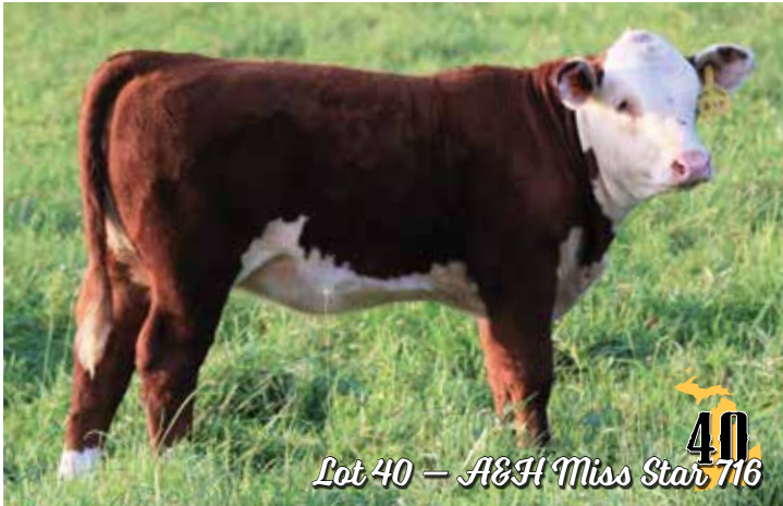
Lot 40 — A&H Miss Star 716

Lot 39 A&H Miss Donna 604 Cow P43807673 — Calved: Feb. 19, 2016 — Tattoo: LE 604 CRR 719 CATAPULT 109 (CHB)(DLF,HYF,IEF) TH 122 711 VICTOR 719T (SOD)(CHB)(DLF,HYF,IEF) CRR 4037 ECLIPSE 808 (DLF,HYF,IEF) CRR P606 WINSTON 550 ET CRR 959 DONNA 137 P43384320 CRR 550 DONNA 794 (DOD)(DLF,HYF,IEF) LCC 63N DOUBLE DUECE 18Y ET TH JWR SOP 166 57G TUNDRA 63N (SOD)(DLF,HYF,IEF) TCC MARY ANN 60 (DLF,HYF,IEF) BOOT HILL BRAVEHEART 628 A&H MISS BETSY 712 A&H MISS 301 P43446740 A&H MISS PEARL 1016 CE 0.3; BW 4.0; WW 52; YW 89; MM 23; M&G 49; MCE -0.3; MCW 94; UDDR 1.07; TEAT 1.05; SC 0.7; CW 65; FAT 0.001; REA 0.53; MARB -0.04; BMI$ 14; CEZ$ 13; BII$ 11; CHB$ 23 • A popular Catapult sire line on top of good ole Boot Hill anchor genetics. This girl has attractive phenotype and balanced EPDs. She's a good one! • Bred AI May 15, 2017, to HH Perfect Timing 0150 ET then pasture exposed to LCC AF Buying Time 244. • Consigned by A&H Herefords