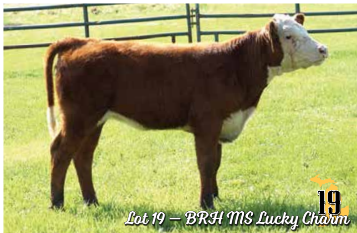
Lot 19 — BRH MS Lucky Charm