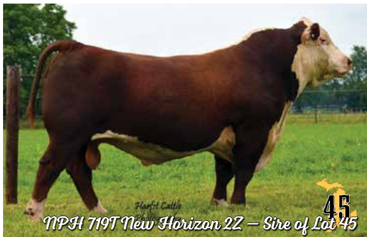
45 NPH 719T New Horizon 22 — Sire of Lot 45