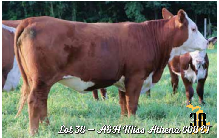
Lot 38 — A&H Miss Athena 608ET