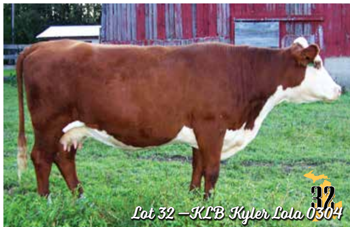
Lot 32 — KLB Kyler Lola 0304