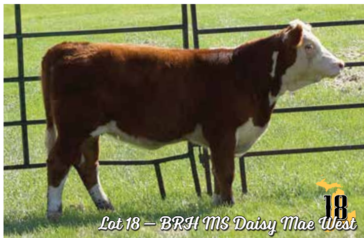
Lot 18 — BRH MS Daisy Mae West