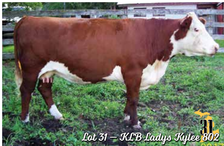
Lot 31 — KLB Ladys Kylee 802