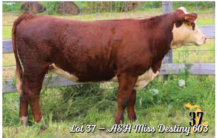
Lot 37 — A&H Miss Destiny 603