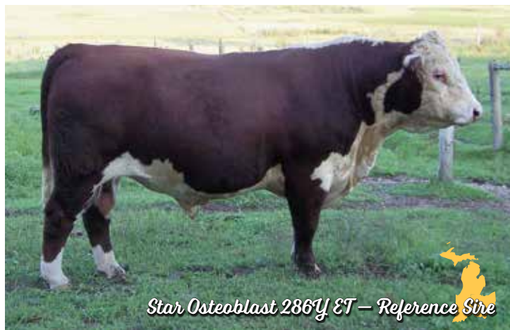
Star Osteoblast 286Y ET — Reference Sire

CE 0.6; BW 4.4; WW 48; YW 75; MM 22; M&G 45; MCE 0.9; MCW 82; UDDR 1.23; TEAT 1.26; SC 0.9; CW 57; FAT 0.008; REA 0.20; MARB 0.04; BMI$ 17; CEZ$ 15; BII$ 16; CHB$ 21