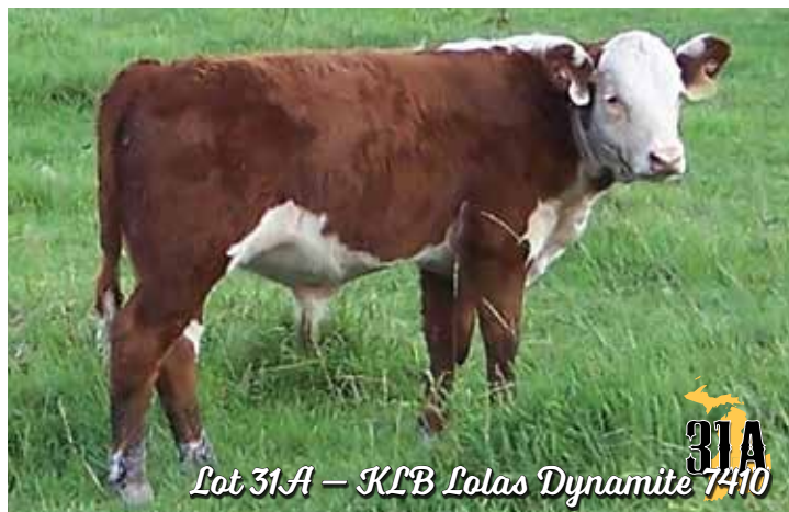
Lot 31A — KLB Lolal Dynamite 7410