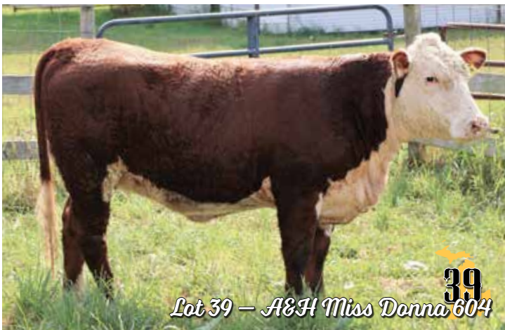
Lot 39 — A&H Miss Donna 604

Lot 39 A&H Miss Donna 604 Cow P43807673 — Calved: Feb. 19, 2016 — Tattoo: LE 604 CRR 719 CATAPULT 109 (CHB)(DLF,HYF,IEF) TH 122 711 VICTOR 719T (SOD)(CHB)(DLF,HYF,IEF) CRR 4037 ECLIPSE 808 (DLF,HYF,IEF) CRR P606 WINSTON 550 ET CRR 959 DONNA 137 P43384320 CRR 550 DONNA 794 (DOD)(DLF,HYF,IEF) LCC 63N DOUBLE DUECE 18Y ET TH JWR SOP 166 57G TUNDRA 63N (SOD)(DLF,HYF,IEF) TCC MARY ANN 60 (DLF,HYF,IEF) BOOT HILL BRAVEHEART 628 A&H MISS BETSY 712 A&H MISS 301 P43446740 A&H MISS PEARL 1016 CE 0.3; BW 4.0; WW 52; YW 89; MM 23; M&G 49; MCE -0.3; MCW 94; UDDR 1.07; TEAT 1.05; SC 0.7; CW 65; FAT 0.001; REA 0.53; MARB -0.04; BMI$ 14; CEZ$ 13; BII$ 11; CHB$ 23 • A popular Catapult sire line on top of good ole Boot Hill anchor genetics. This girl has attractive phenotype and balanced EPDs. She's a good one! • Bred AI May 15, 2017, to HH Perfect Timing 0150 ET then pasture exposed to LCC AF Buying Time 244. • Consigned by A&H Herefords