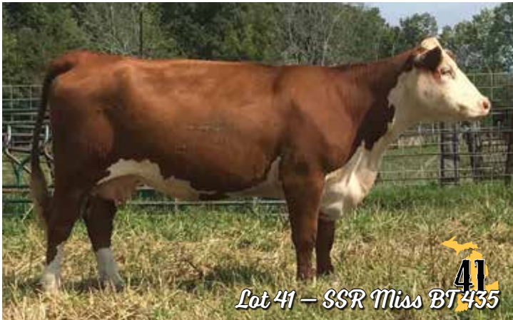
Lot 41 — SSR Miss BT 435

Lot 40 A&H Miss STAR 716 Cow P43807706 — Calved: April 3, 2017 — Tattoo: LE 716 CRR ABOUT TIME 743 (SOD)(CHB)(DLF,HYF,IEF) THM DURANGO 4037 (SOD)(CHB)(DLF,HYF,IEF) CRR D03 CASSIE 206 (DLF,HYF,IEF) LCC BACK N TIME ET (DLF,HYF,IEF) ARF MS BRIDGET D48R P43301087 LCC GETTIN BY ON TIME 17X ET STAR BRIGHT FUTURE 533P ET (DLF,HYF,IEF) REMITALL ONLINE 122L (SOD)(CHB)(DLF,HYF,IEF) RB L1 DOMINETTE 8116 (DLF,HYF,IEF) DRF JWR PRINCE VICTOR 711 (SOD)(CHB) JWR 2004 VICKI 70F 135K STAR 533P JACKIE 153T P42774408 JWR K135 JACKIE 119P CE -2.1; BW 5.0; WW 57; YW 87; MM 24; M&G 53; MCE 0.7; MCW 104; UDDR 1.21; TEAT 1.17; SC 0.8; CW 65; FAT -0.017; REA 0.31; MARB -0.01; BMI$ 15; CEZ$ 12; BII$ 13; CHB$ 25 • A very attractive heifer calf sired by our herd bull LCC AF Buying Time 244. This calf would make someone a nice show heifer and a breeding tool for the future. Her dam is a giant Bright Future daughter we acquired from Star Lake. Consistency, performance and some bling here. • Consigned by A&H Herefords