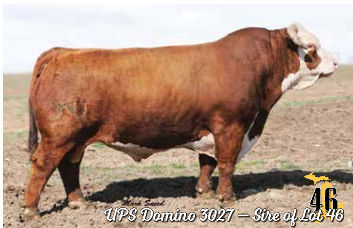
46 UPS Domino 3027 — Sire of Lot 46