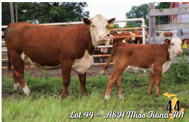
44 Lot 44 — A&H Miss Fiona 401