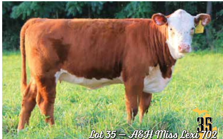
Lot 35 — A&H Miss Lexi 702

• This herd bull is out of STAR Osteoblast 286Y ET and one of my Dams Of Distinction. Look at his offspring 7305, 7310 and 7714. Cows 802, 0304 and 0308 are pastured exposed to him.