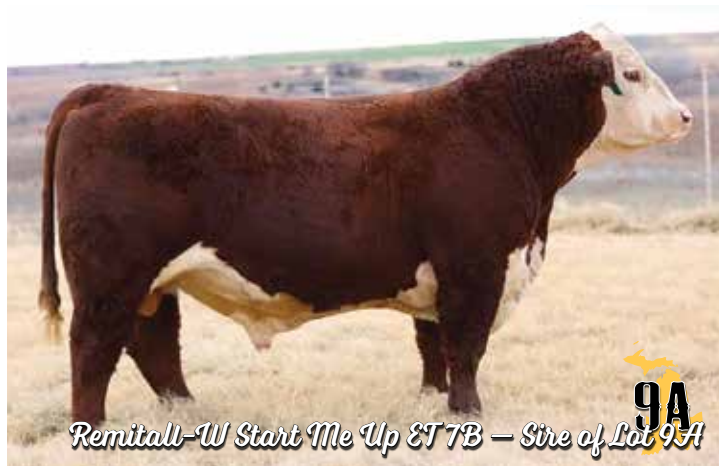
Remitall-W Start Me Up ET 7B — Sire of Lot 9A