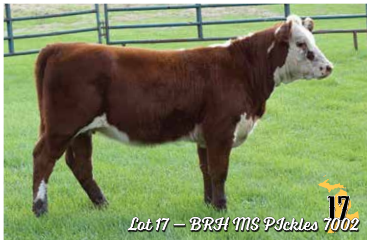
Lot 17 — BRH MS Pickles 7002