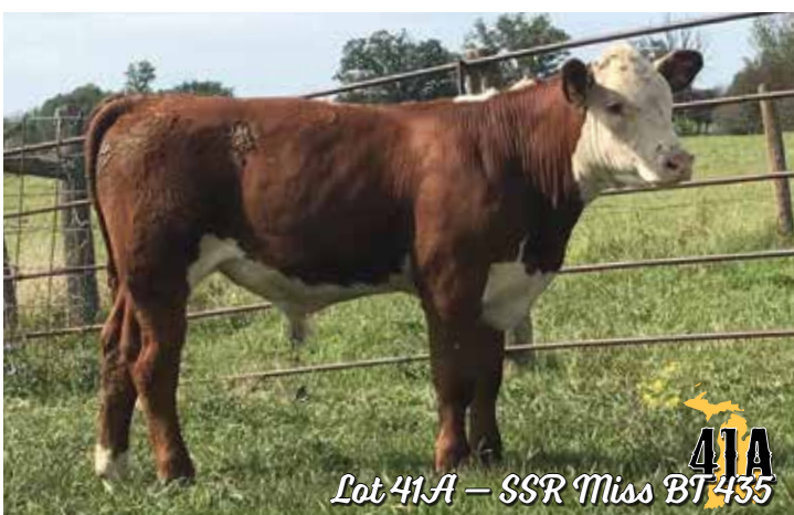
Lot 41A — SSR Miss BT 435

Lot 41 SSR Miss BT 435 Cow P43522624 — Calved: April 13, 2014 — Tattoo: RE 435 CE -3.8; BW 5.2; WW 55; YW 84; MM 26; M&G 53; MCE 1.0; MCW 99; UDDR 1.18; TEAT 1.22; SC 1.0; CW 61; FAT 0.001; REA 0.33; MARB 0.03; BMI$ 16; CEZ$ 11; BII$ 15; CHB$ 24 • A daughter of LCC Back N Time ET out of a dam of Distinction. This one is hard to part with. • Bred AI to June 24, 2017, to BRH Crown Royal 6001, Champion bull at UP State Fair, then pasture exposed to BF 4R Ribeye 1501. Either way this calf can be a great one. • Consigned by Sugar Sweet Ranch