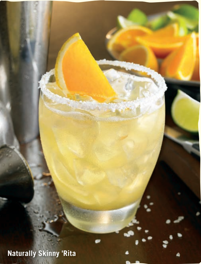
Naturally Skinny 'Rita