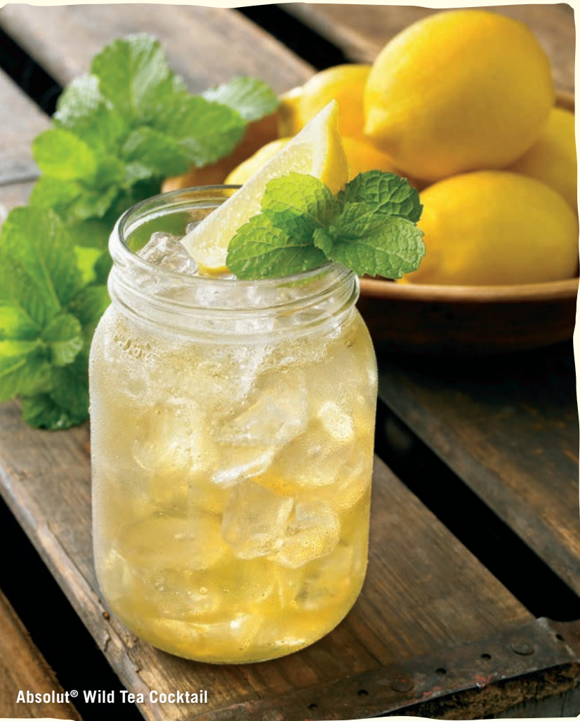
Absolut® Wild Tea Cocktail