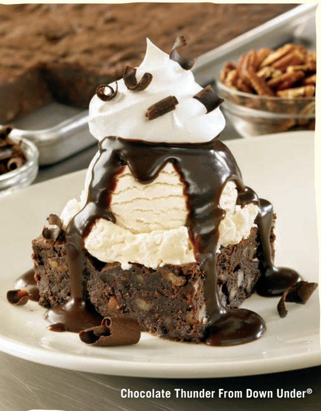
Chocolate Thunder From Down Under®