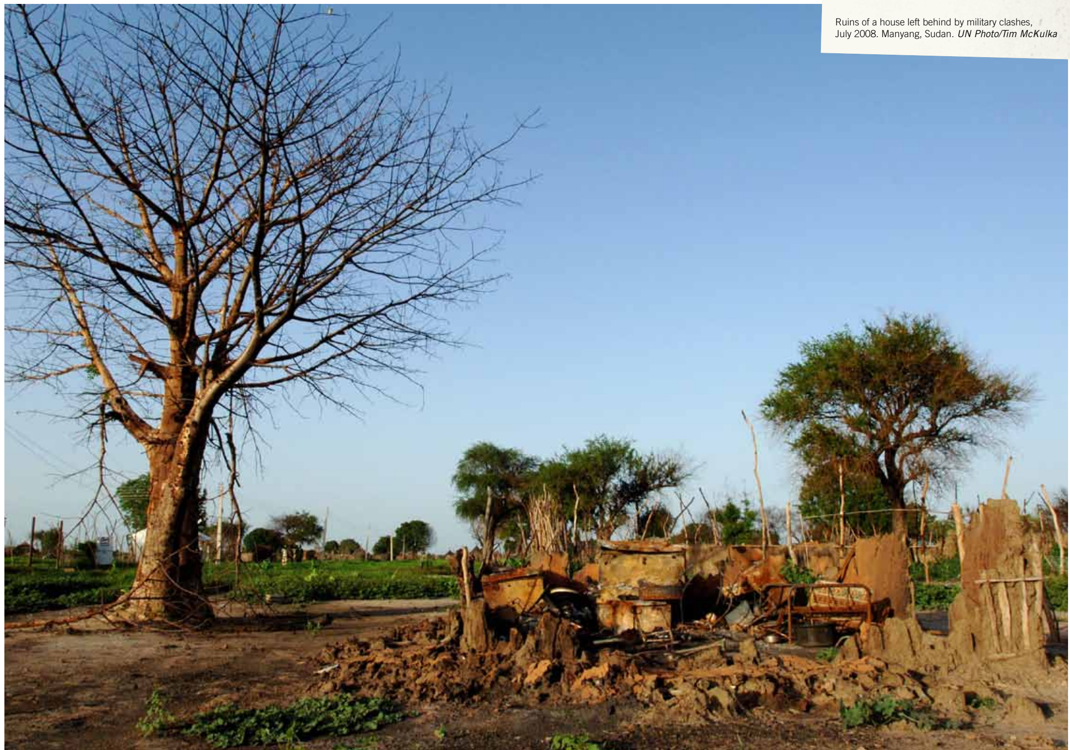
Ruins of a house left behind by military clashes, July 2008. Manyang, Sudan.