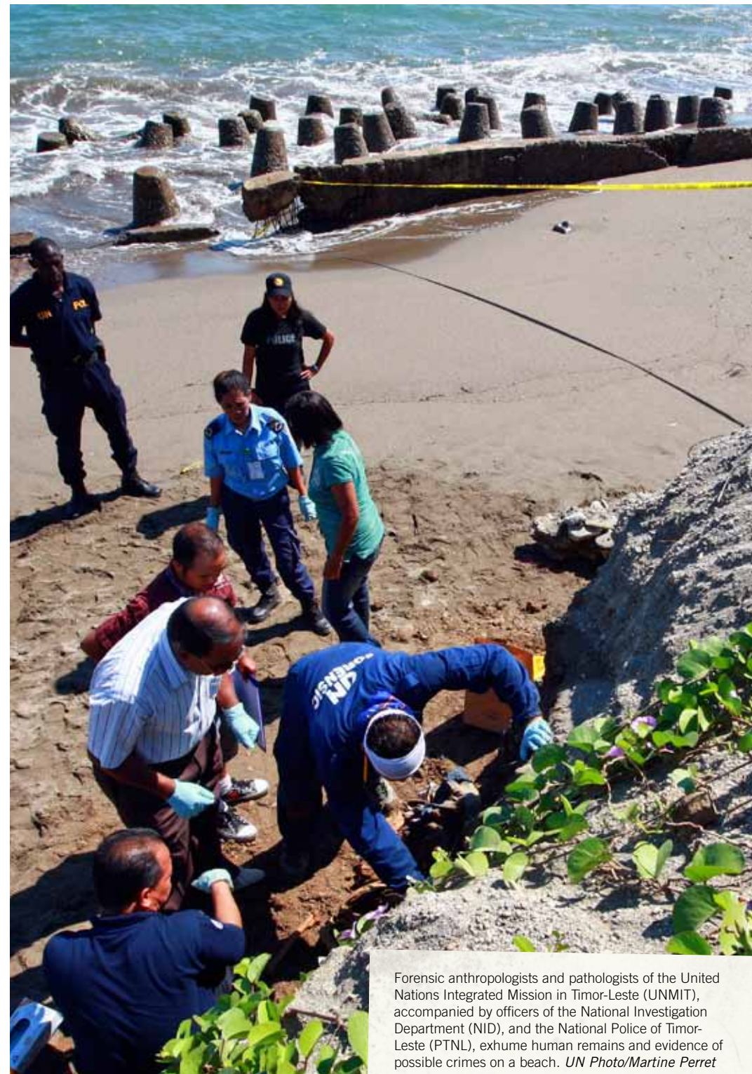
Forensic anthropologists and pathologists of the United Nations Integrated Mission in Timor-Leste (UNMIT), accompanied by officers of the National Investigation Department (NID), and the National Police of Timor-Leste (PTNL), exhume human remains and evidence of possible crimes on a beach.

Keep in mind that to the extent that the local authorities may themselves be responsible for the crimes, it may be inappropriate or even dangerous for you to contact them. You should in any case avoid actually touching or collecting any potentially relevant physical evidence unless you are explicitly instructed to do so by your superiors. In particular, you should avoid touching or moving any bodies or body parts that may be present at the crime scene. Note what you see, take pictures, make drawings, but only as a very last resort, take things with you. If you do take something with you, remember only to take things that you are qualified and competent to handle and store.