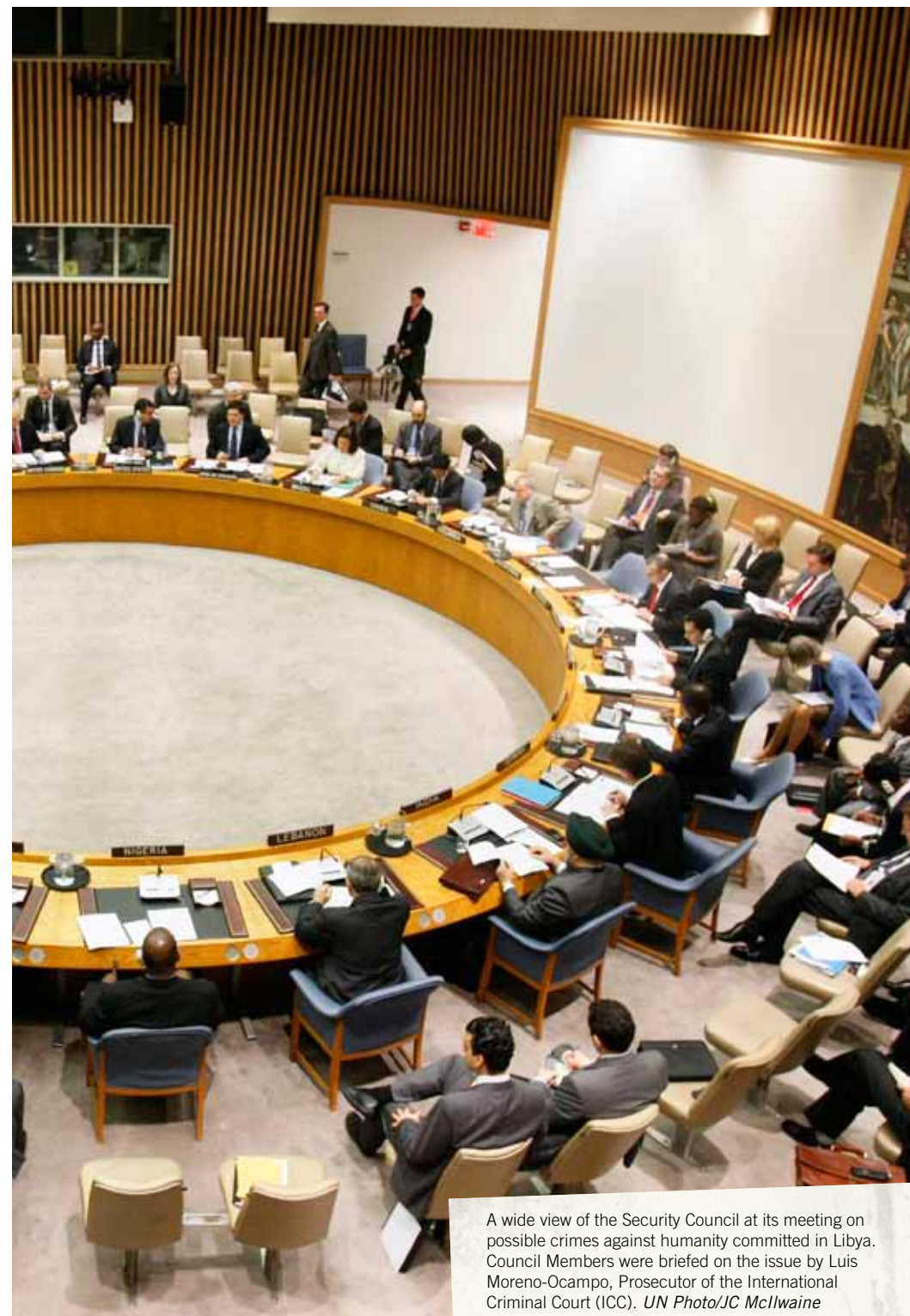
A wide view of the Security Council at its meeting on possible crimes against humanity committed in Libya. Council Members were briefed on the issue by Luis Moreno-Ocampo, Prosecutor of the International Criminal Court (ICC).

International criminal courts and tribunals generally take very good care of the information that they collect. Nonetheless, for your sake and theirs, it is highly recommendable that you retain copies of the information that you choose to provide to these institutions. Make sure that you receive a receipt for the information that you have provided and keep this for your own records.