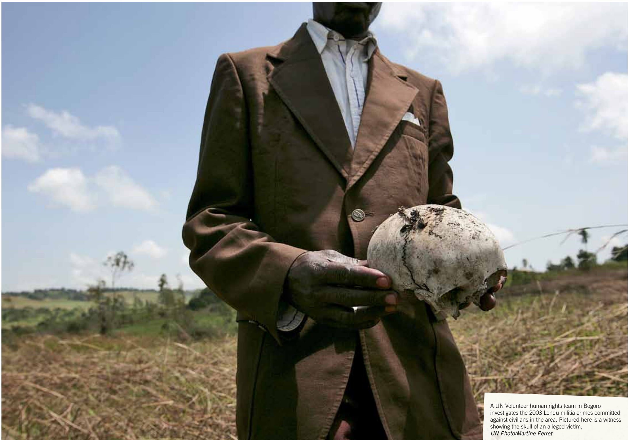
A UN Volunteer human rights team in Bogoro investigates the 2003 Lendu militia crimes committed against civilians in the area. Pictured here is a witness showing the skull of an alleged victim.