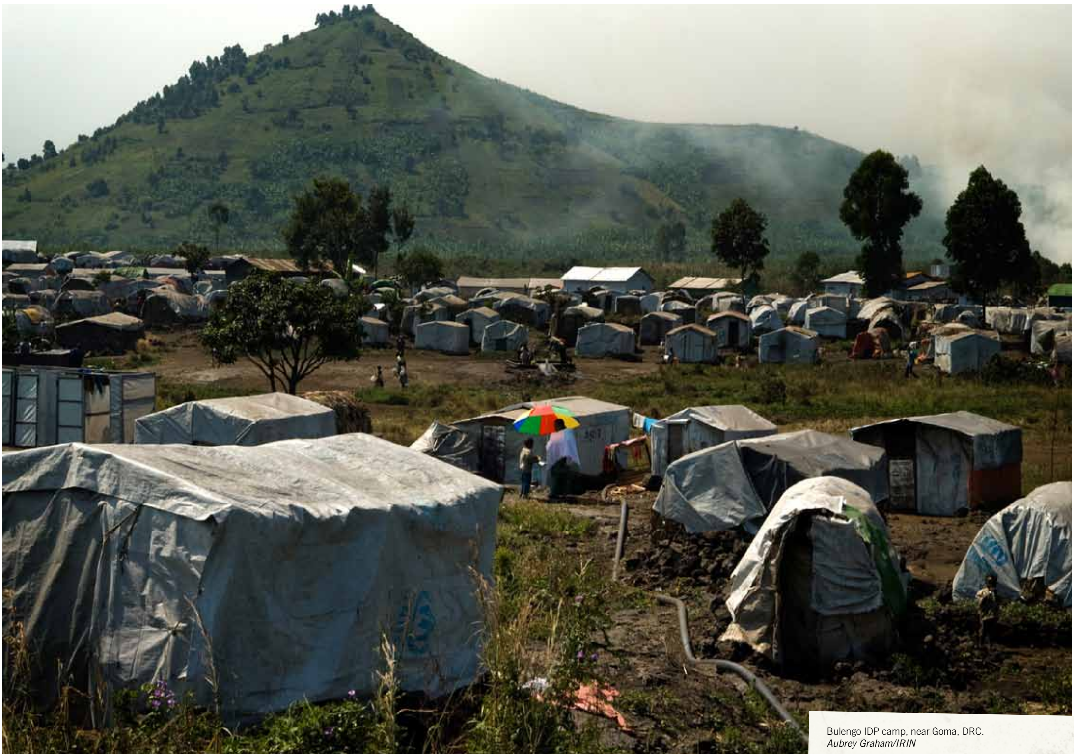
Bulengo IDP camp, near Goma, DRC.