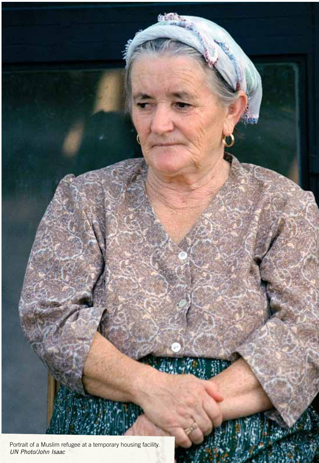
Portrait of a Muslim refugee at a temporary housing facility.

and/or provide a meal. However, make sure that this is clearly documented and does not in any way constitute payment for an interview. If a witness or intermediary does require reimbursement for expenses incurred, make sure to obtain receipts for such expenditures if this is at all possible. Particularly in impoverished areas, news will spread rapidly of any kind of payment of witnesses, and you will find yourself flooded with new “witnesses.” Payment of interviews also risks compromising genuine witness interviews.