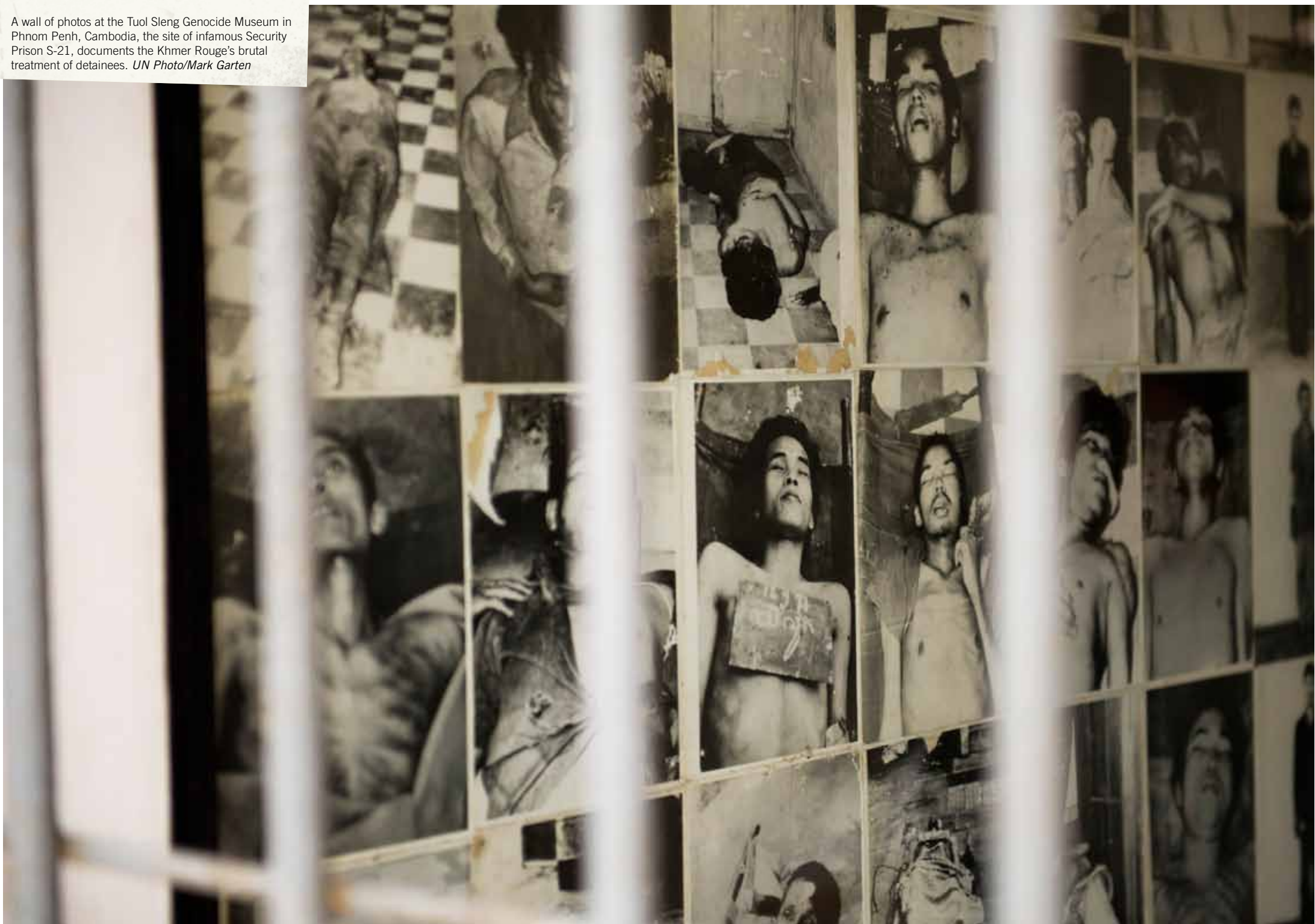
A wall of photos at the Tuol Sleng Genocide Museum in Phnom Penh, Cambodia, the site of infamous Security Prison S-21, documents the Khmer Rouge's brutal treatment of detainees.