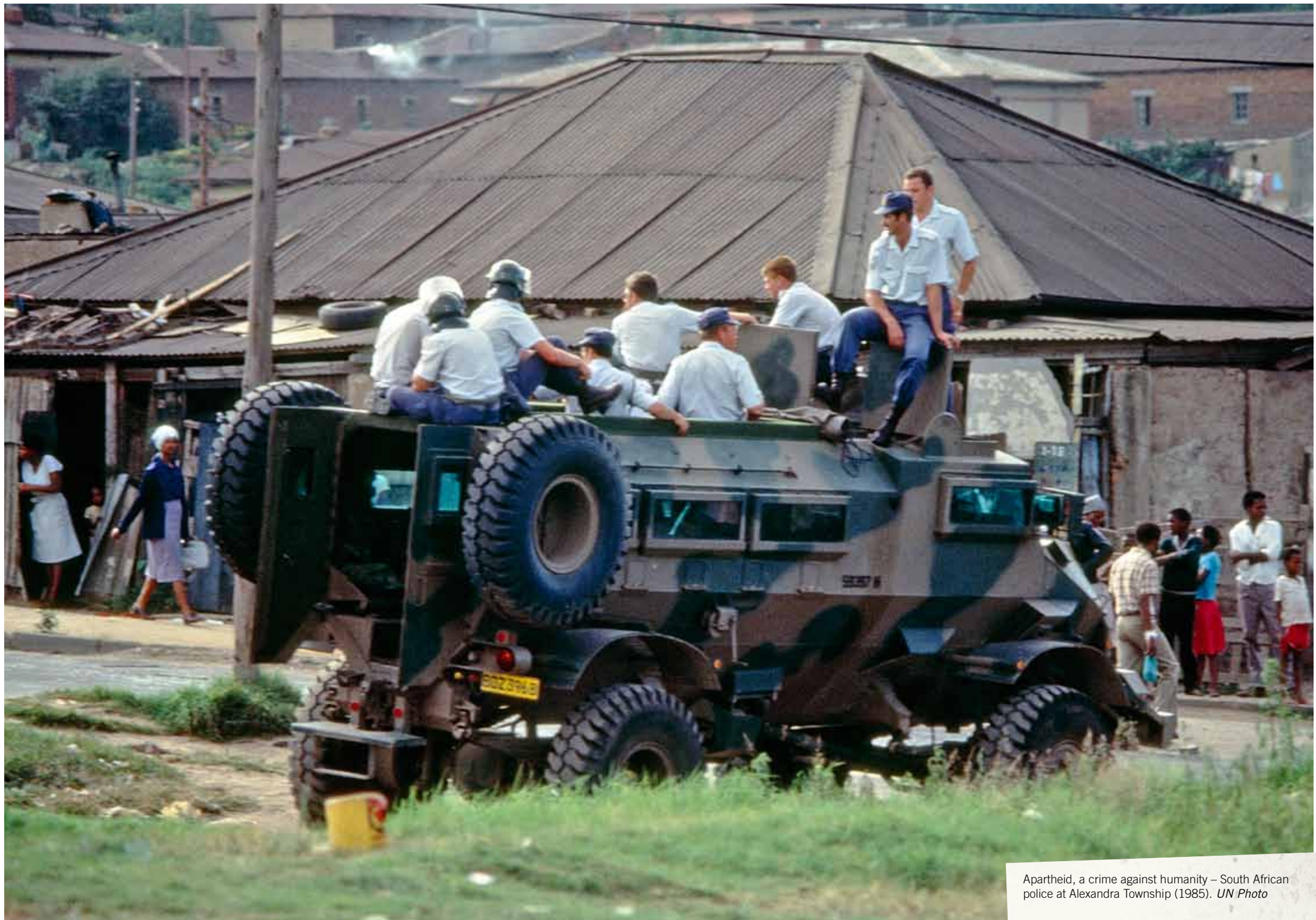
Apartheid, a crime against humanity – South African police at Alexandra Township (1985).