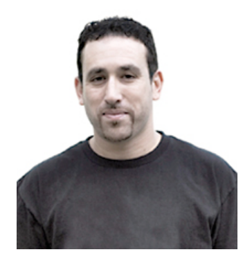
Antonio M. Nacrur A/V Support (Offline and Online Editing), New Wave Entertainment Burbank, CA Recent HD Projects: Behind-the-scenes and special features in HD for Stealth, Doom and Brokeback Mountain DVDs

Cut 60i Digitzed Footage in 24fps During Your Offline, Before You Bring it to the Online Suite