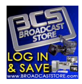
Now in the demo room