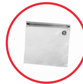
Vacuum Seal Bag