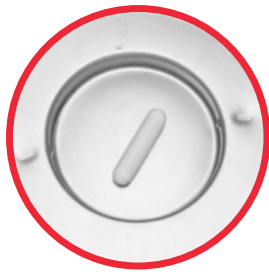
Agitator X 2