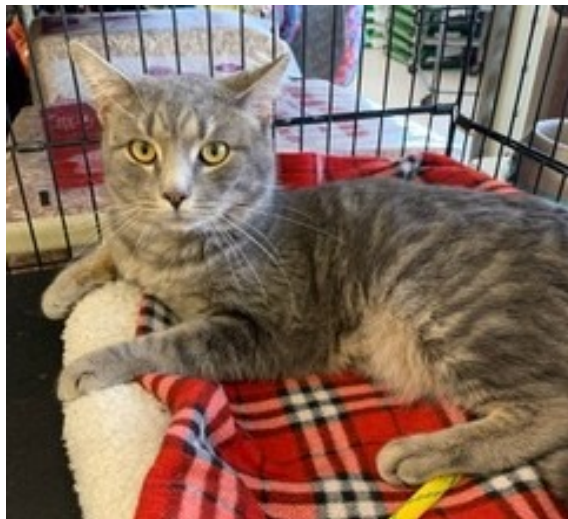
Cutter (FCID# 10/31/2019-19) Adult • M

What a handsome fellow! Please meet Cutter ! He is so sweet! So why after his owner died did the family apparently put him out to fend for himself???