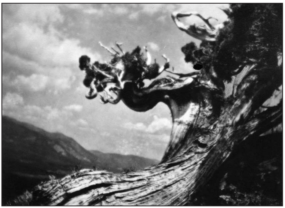
Fig. 4. Anne Brigman, Harlequin , undated. Gelatin silver print glued into album. Anne Brigman Papers, Stieglitz/O'Keefe Archive, Beinecke Library, YCAL MSS 380. Reproduced with permission of the Beinecke Library.