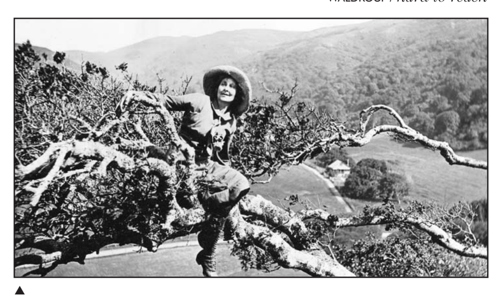
Fig. 1. portrait of Anne Brigman, c. 1912. Gelatin silver print.