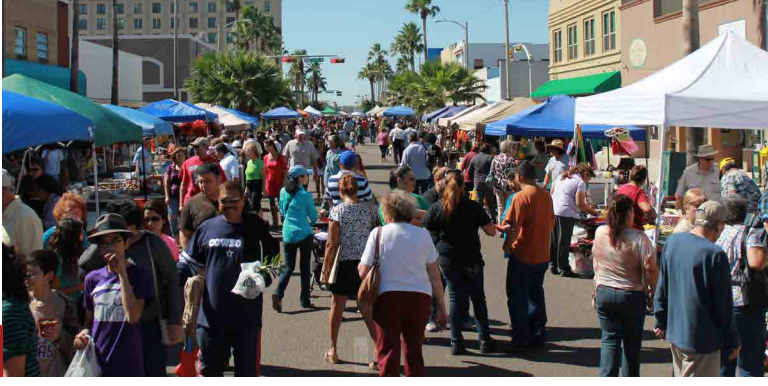
Downtown Harlingen Market Days