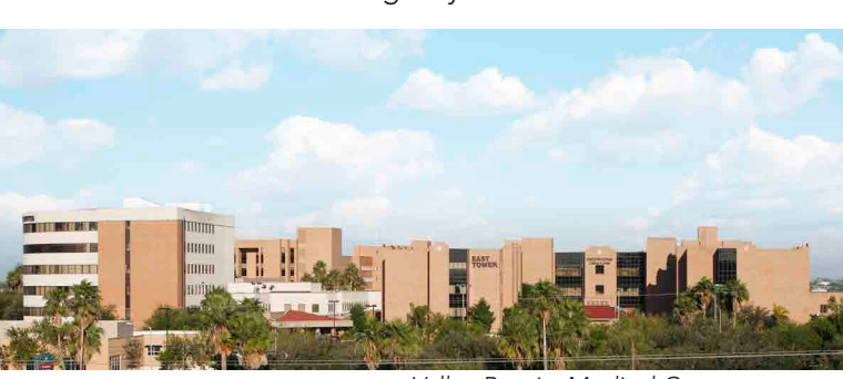
Valley Baptist Medical Center

Valley Baptist Medical Center, with 586 beds and its caring, dedicated doctors and staff, has pioneered many types of heart, stroke, and other procedures in the Valley, as well as serving as the area leader in orthopedics, minimally-invasive and robotic surgery, women and children's health care, cancer and diabetes care, and trauma and emergency care.