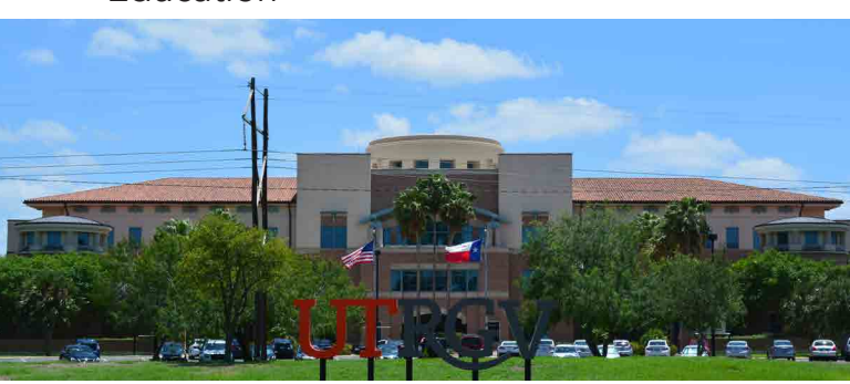
UTRGV Regional Academic Health Center & Medical School

University of Texas Rio Grande Valley (UTRGV) has campuses throughout the Valley, empowers successful futures, enhances daily life, and lets our region shine as a global innovator in higher education, bilingual education, health education, biomedical research, and emerging technology that inspires positive change.