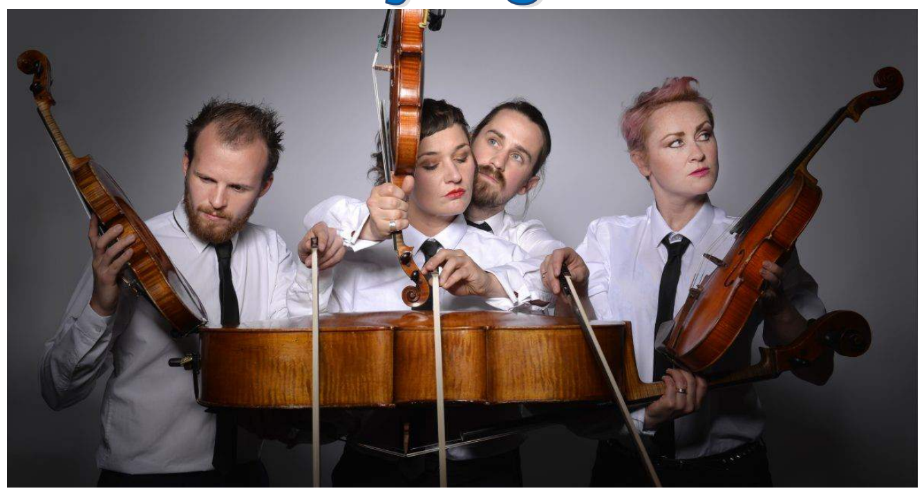
7.30pm Saturday 8th December