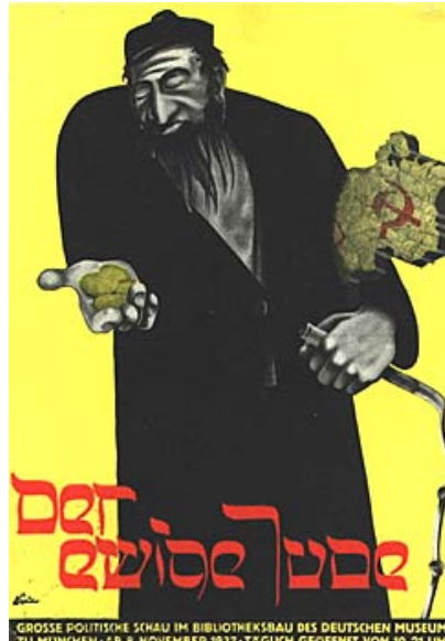
Text translation: "The Eternal Jew"

Discuss and respond to the following questions based on the above image in your group.