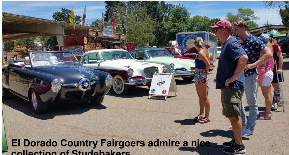
El Dorado Country Fairgoers admire a nice collection of Studebakers.