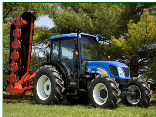
Figure 3. Disk mower cutter.