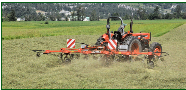
Figure 6. Tedder used for inverting dried forage to speed drying.