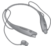
LG | TONE™ HBS-700