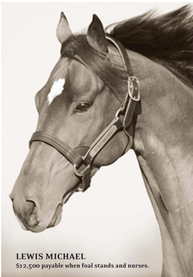
LEWIS MICHAEL $12,500 payable when foal stands and nurses.