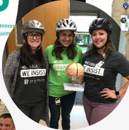
RAYGUN PARTNERSHIP HELMET HAIR, DON'T CARE