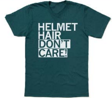
PROCEEDS BENEFIT ON WITH LIFE August 2019