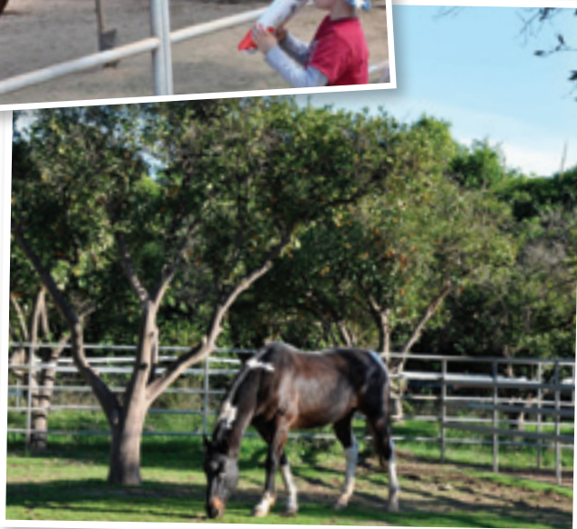
Cheyenne, pictured here, is one of many horses undergoing rehabilitation at California Coastal Horse Rescue.