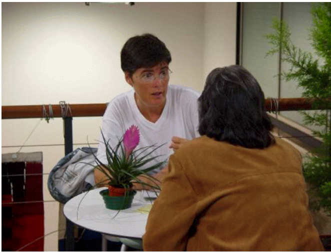
Doctors for health counseling.