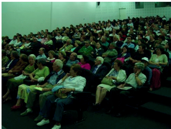
A 300 seat auditorium packed full every night.