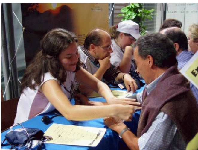
Blood pressure check-up.