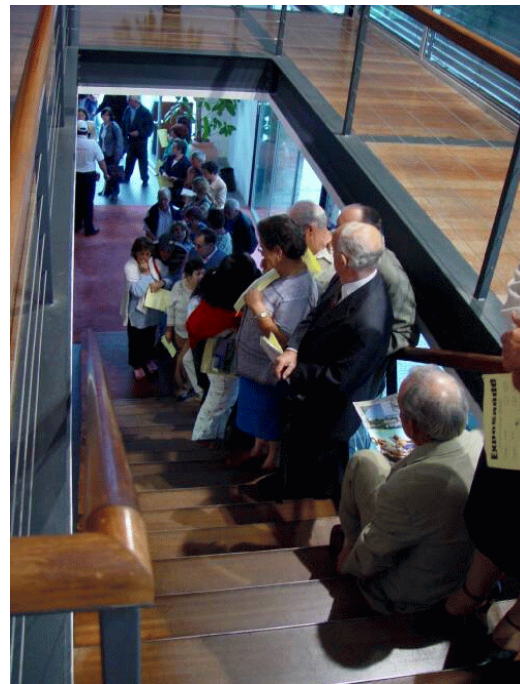
People waiting for entrance, already halve an hour before opening.

Learn more about Health-EXPOs at: www.heresources.com/