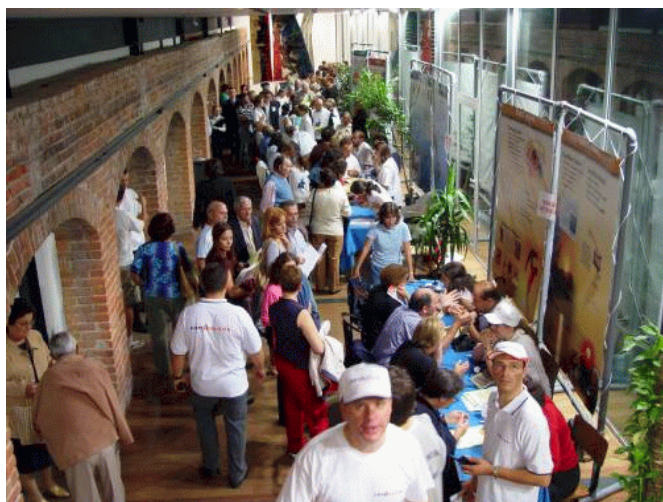
View at the crowd. This is only half of the Expo.