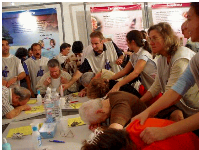
Many hands in the massage section.