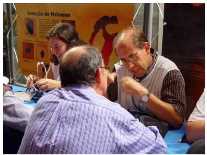
In Porto everybody was highly enthusiastic.