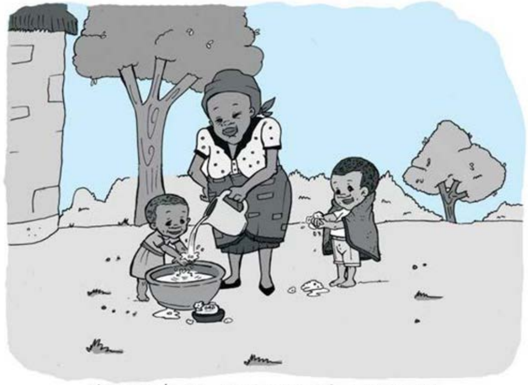
Use good hygiene to stop germs from spreading.