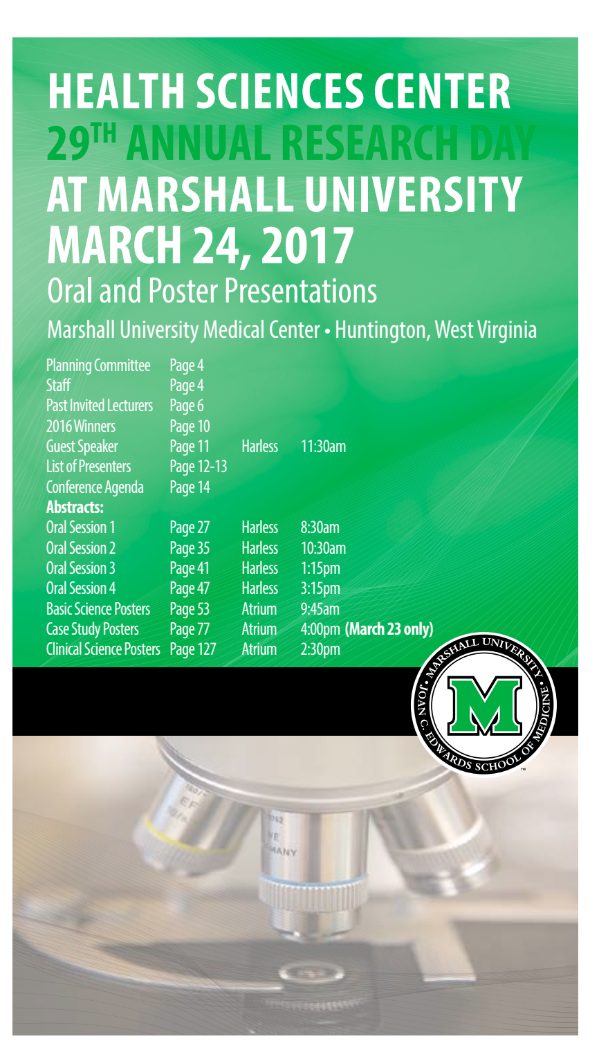
March 23 - Special Viewing - Case Study Poster Presentations -4:00PM-5:30PM - Medical Center Atrium