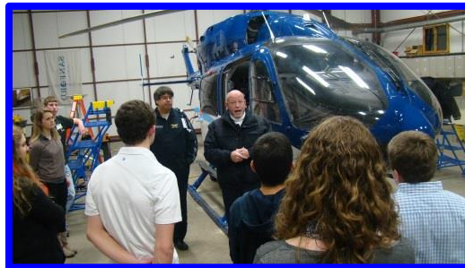
Sanford YME visit with Intensive Air

https://www.sanfordhealth.org/about/academic-affairs/career-exploration