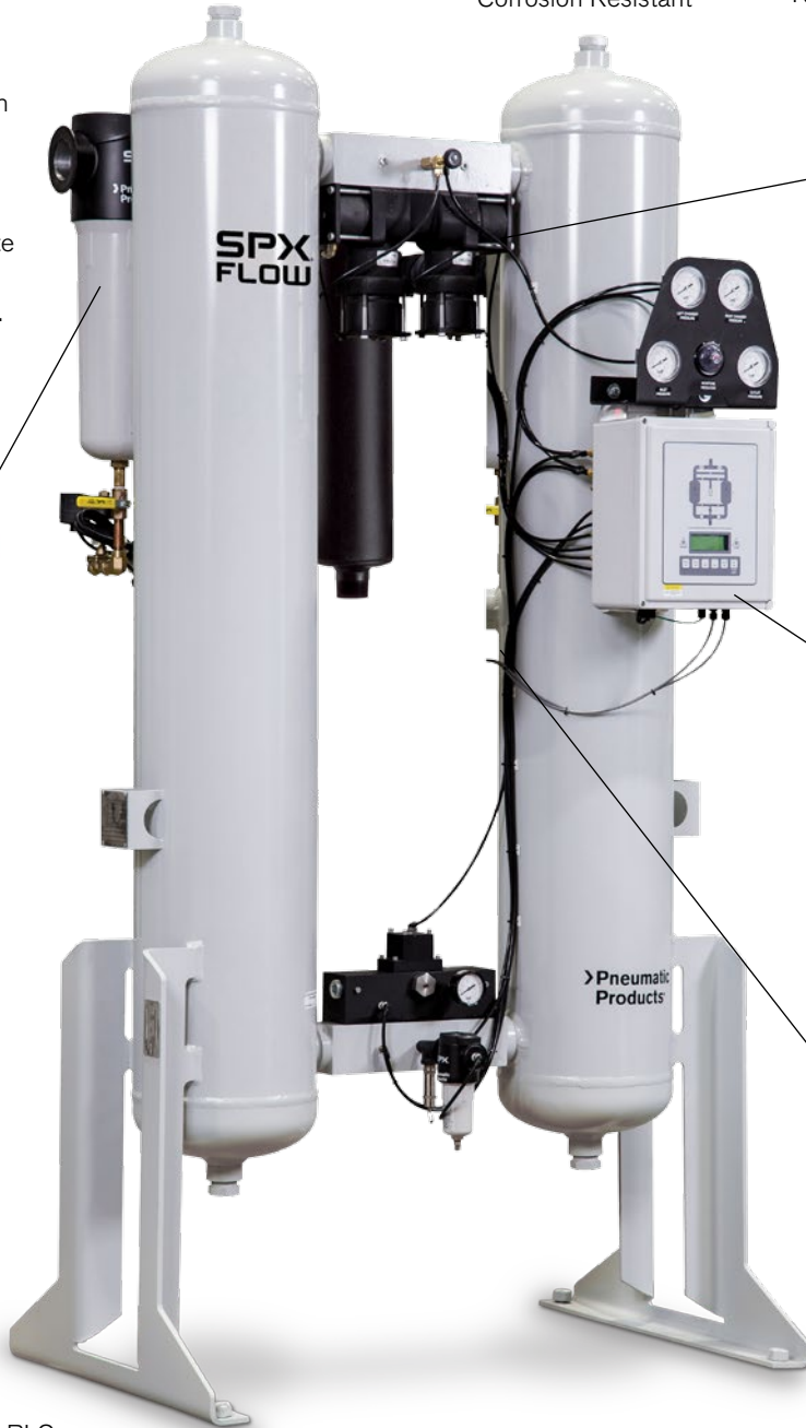
*Model Shown with Optional Features