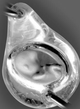
magnified view of bead