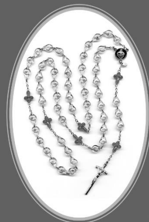
Large Rosary of The Unborn