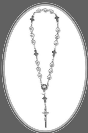
Chaplet of The Unborn