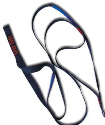
2. Multi Step (Etrier) QSRK/ETRIER