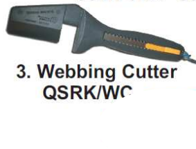
3. Webbing Cutter QSRK/WC

Available in: 20m R/KIT -20 30m R/KIT -30