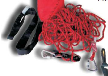
2. 11mm Static Kermantle Rope

Available in: 20m R/KIT -20 30m R/KIT -30