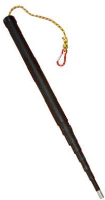
1. 3m Telescopic Pole QSTP