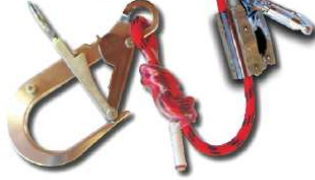
2. 11mm Static Kermantle Rope

Available in: 5m RGS -05 10m RGS -10 15m RGS -15 20m RGS -20