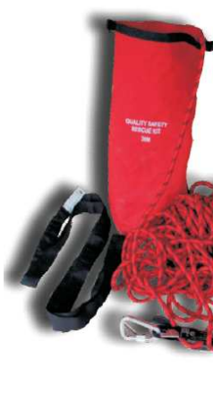
1. Red Protection Bag QSRK/RPB