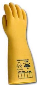
Regeltex - Beige