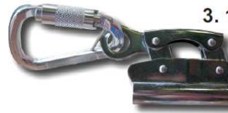
3. 11-13mm Rope Grab QSF/RG

Available in: 5m RGS -05 10m RGS -10 15m RGS -15 20m RGS -20