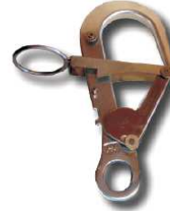
4. Stainless Steel Remote Pylon Hook QSRP/HOOK

Complete with Tri-Lock/ Captive eye aluminium karabiner