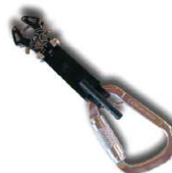
3. Frog QSRK/FROG

Pole attachment and tri-lock aluminium karabiner