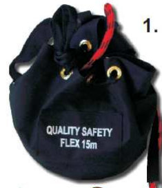
1. Black Protection Bag QSF/BPB