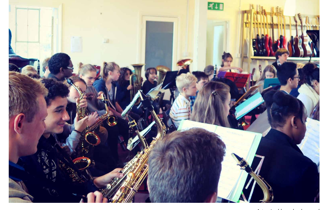
A typical band rehearsal