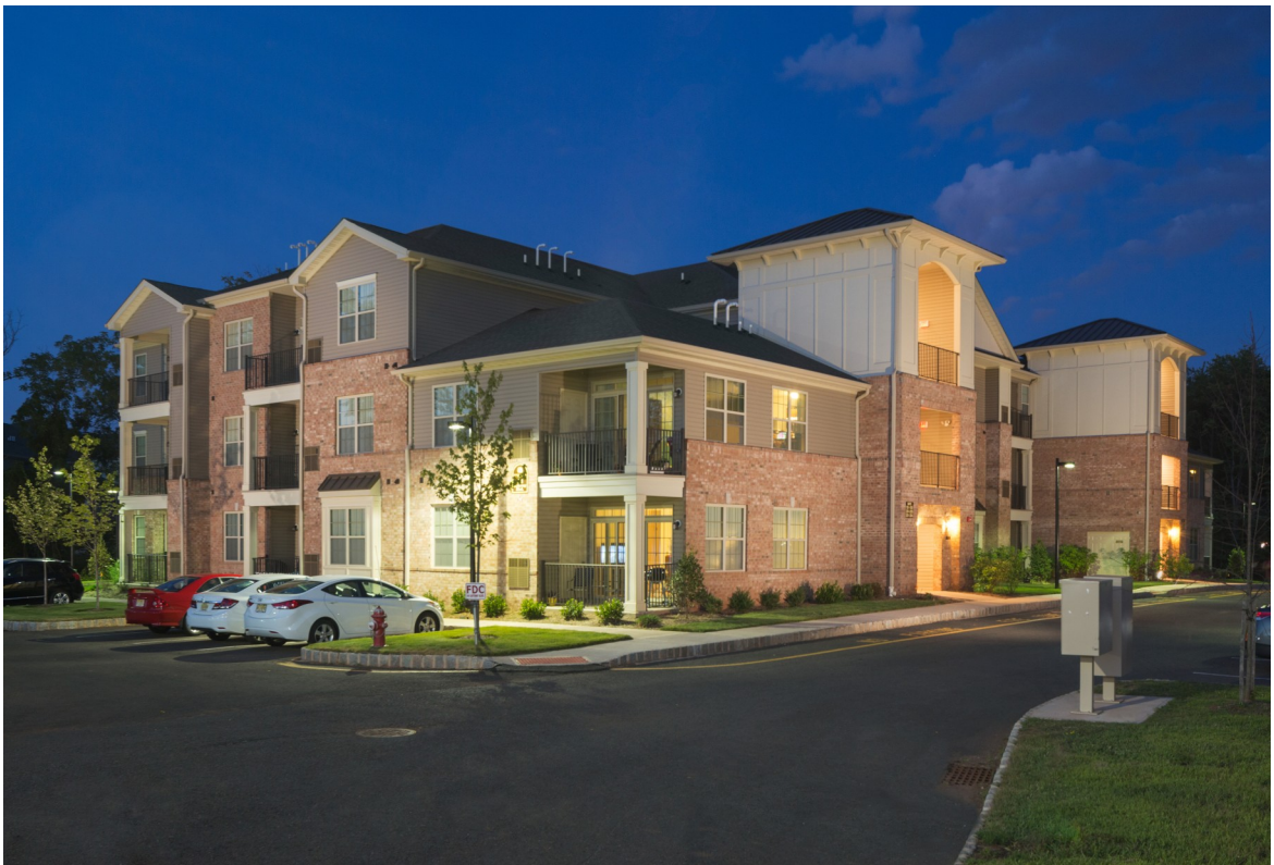
Sunnymeade Run boasts 122 one-, two- and three-bedroom affordable rental homes in Hillsborough Township.