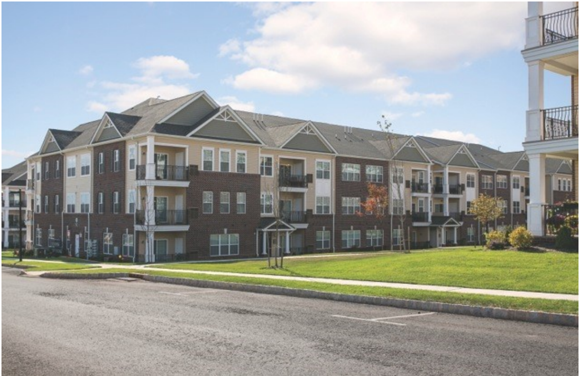
Stone Bridge at Raritan features one-, two- and three-bedroom moderate income homes reserved for the large concentration of Military veterans that reside in and around this Somerset County, N.J. Borough.