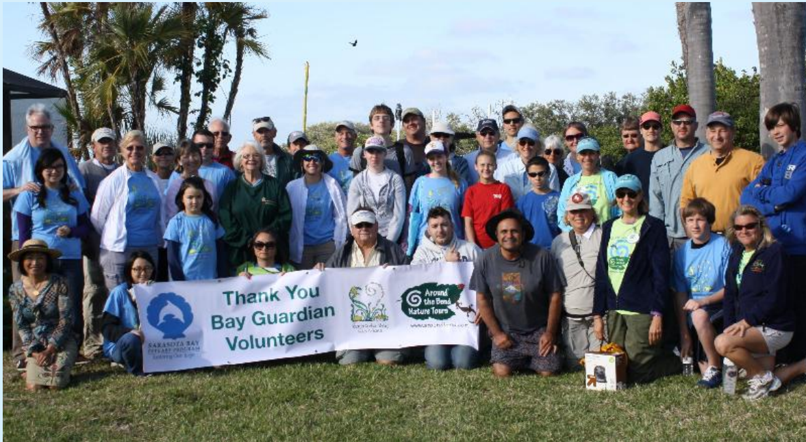
Bay Guardian volunteers following the project at Bowlees Creek Island Bird Sanctuary