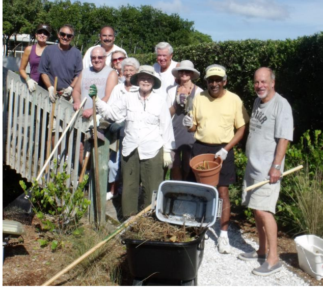
Volunteers with the Sunbow Bay Condo Association

The recently completed project is part of a multi-year plan by Sunbow Bay to make their 10-acre property more Bay-friendly with the use of Florida-friendly landscaping principles. The project launched in 2010 has reduced the use of pesticides, fertilizers and irrigation saving energy and money.