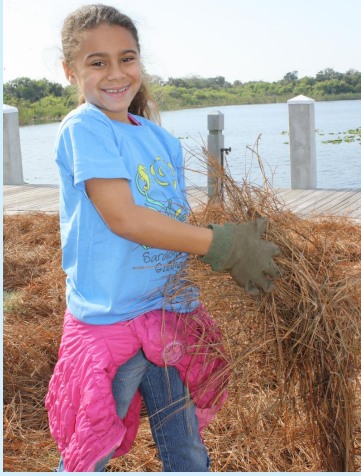
Young volunteer at Jiggs

Old Braden River Historical Society, Cub Scout Troup 22, Take Stock in Children, Around the Bend Nature Tours, and staff members with Manatee County Natural Resources. The Manatee County Natural Resources Department and Old Braden River Historical Society donated the native plants.