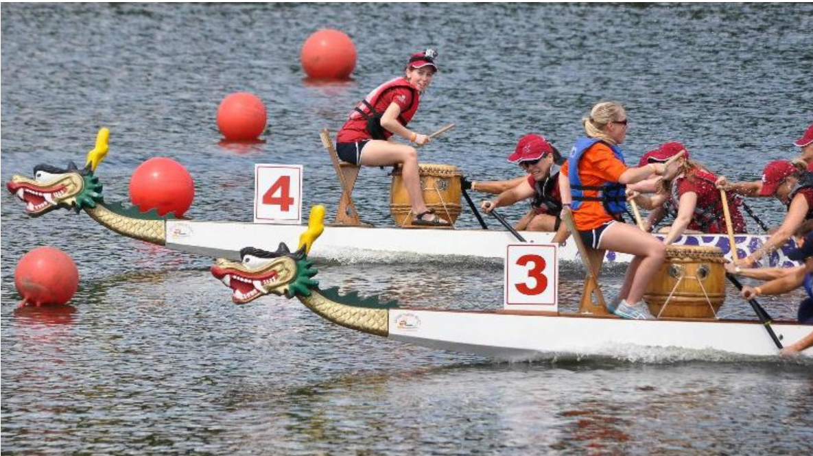
Dragon Boat Races are one of the new features of the 2013 Sarasota Bay Water Festival

Thank you to all of the early 2013 sponsors : Sarasota County, Freedom Boat Club, Manatee County, Sarasota Sailing Squadron, Scheda Ecological Associates, Whole Foods Market, Sierra Club, Southwest Florida Water Management District, City of Sarasota, Mote Marine Laboratory, City of Bradenton, Caldwell Trust Company, Save Our Seabirds, Town of Longboat Key, Triple 3 Marketing, Around the Bend Nature Tours, High Five Dragon Boat, Friends of Sarasota County Parks, Gold Coast Eagle Distributing, and Sun King Disc Sports. Like the Water Festival on facebook .