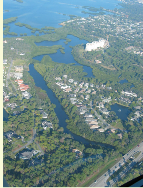
View of North Creek

SBEP Technical Advisory Committee (TAC). Their ongoing support enhances the SBEP mission and various technical projects and studies.