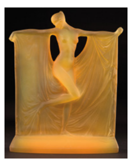
R. Lalique Opalescent Yellow Glass Suzanne Statuette