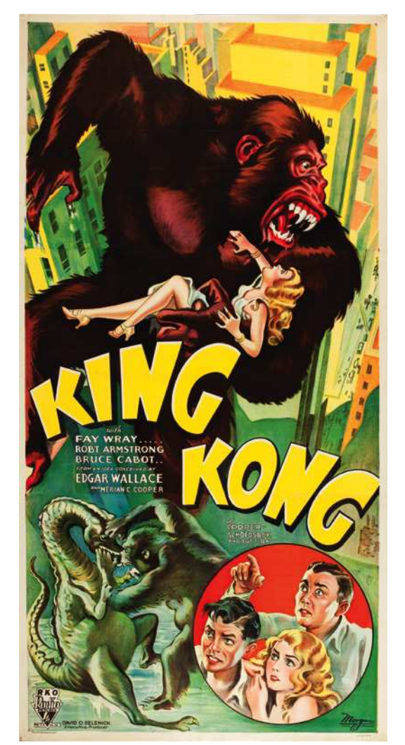
King Kong (RKO, 1933) Three-sheet (40.25" x 79") Style B

International headlines were made in the days before, and certainly just after the auction when the earliest known Mickey Mouse movie poster – the only known 1928 Celebrity Productions Mickey Mouse Stock Poster One Sheet – drew interest from film and Mickey fans alike to soar to $101,575.