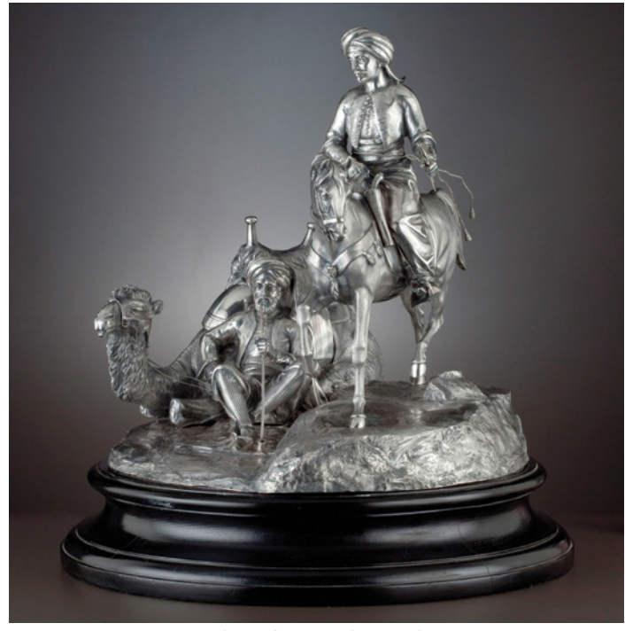
A Monumental Garrard Victorian Silver Figural Centerpiece solp on December 5, 2012 for $32,500