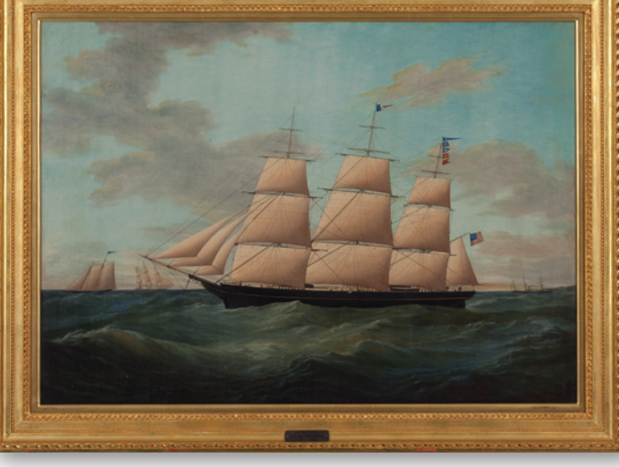
United States, an oil painting by James Edward Buttersworth, sold for $68,500 from the MBNA Collection of Maritime Art & Ship Moc