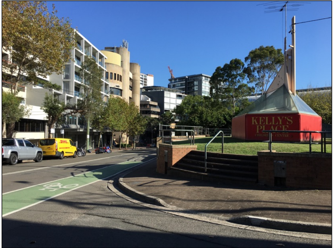
Figure 6: Kellys Place and childcare centre.