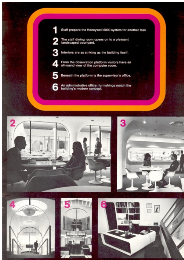
Figure 13: Further photographs inside the St Leonards Centre when it opened in 1972.

Welcome to the St Leonards Centre, Sydney, 1972. (2018).