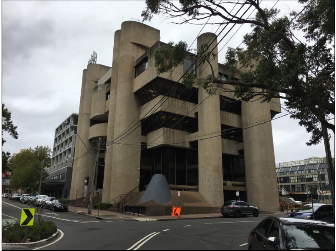
Figure 3: Looking south towards the site from Oxley Street.

A dramatically assertive building marked by curvilinear plan bastion tower elements of textured off form reinforced concrete. Between these the storeys step outwards towards the top, bestowing upon the structure a character of great and not totally pleasant strength. It is a well-made and crafted building. This building is designed in the Late twentieth century brutalist style.