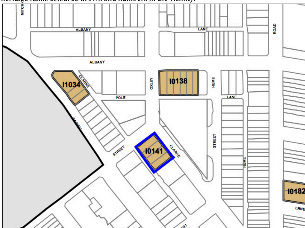
Figure 2: An extract from Heritage Map 001 from the North Sydney LEP 2013 the extent of the site is outlined in blue.

Figure 3 below shows the subject site (outlined in blue and marked I01141) and heritage items coloured brown and numbers in the vicinity.