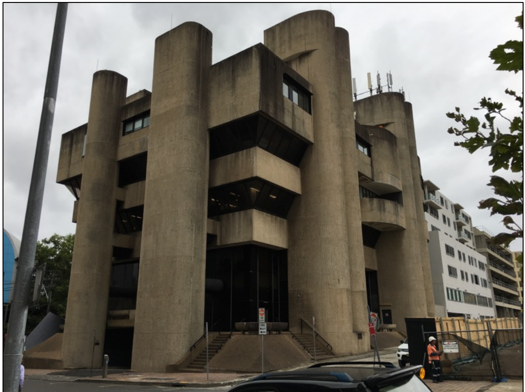
Figure 5: Looking south east from Oxley Street and Clarke Lane towards the site.