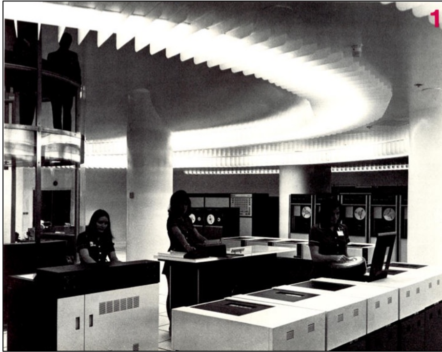
Figure 12: The interior of the building on Level 8.

Welcome to the St Leonards Centre, Sydney, 1972. (2018).