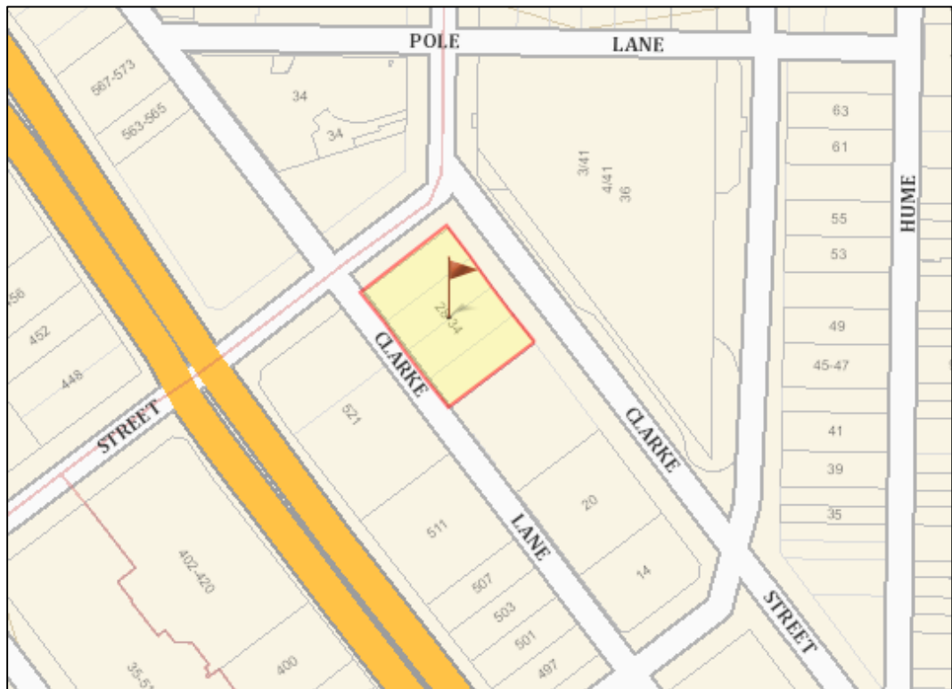
Figure 1: An map showing the lot boundaries of the site. The curtilage of the heritage item is highlighted in yellow.

Figure 1 below provides the following map of the site.