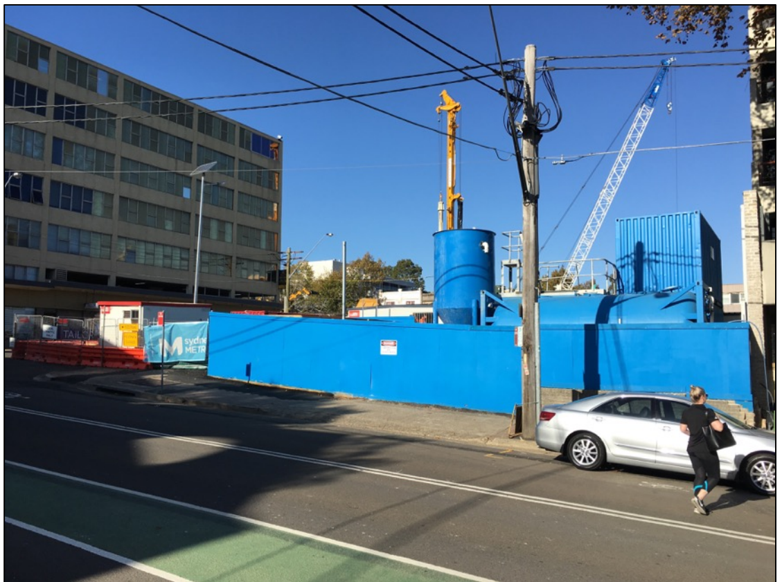
Figure 10: The Crows Nest Metro Station under construction.