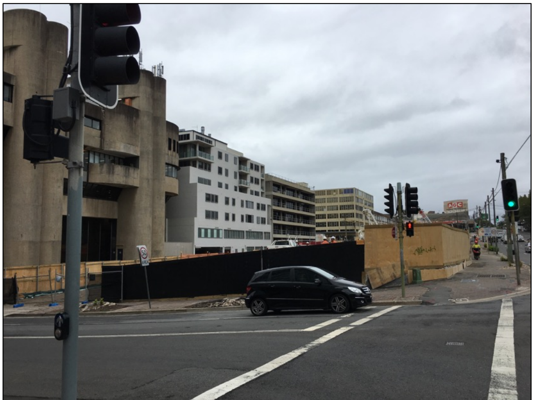
Figure 7: The site when viewed from the Pacific Highway.