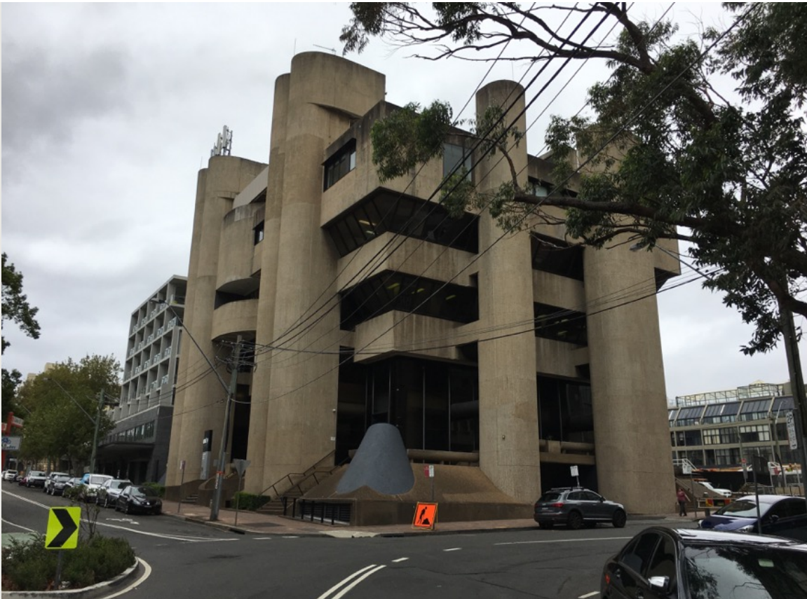
St Leonards Centre Nos 28-34 Clarke Street, Crows Nest September 2018 | J2971