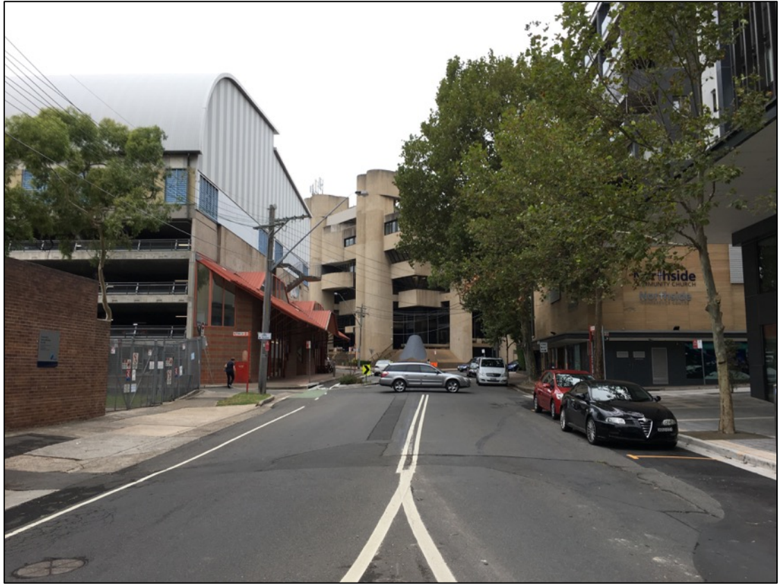
Figure 4: Looking towards the St Leonards Centre