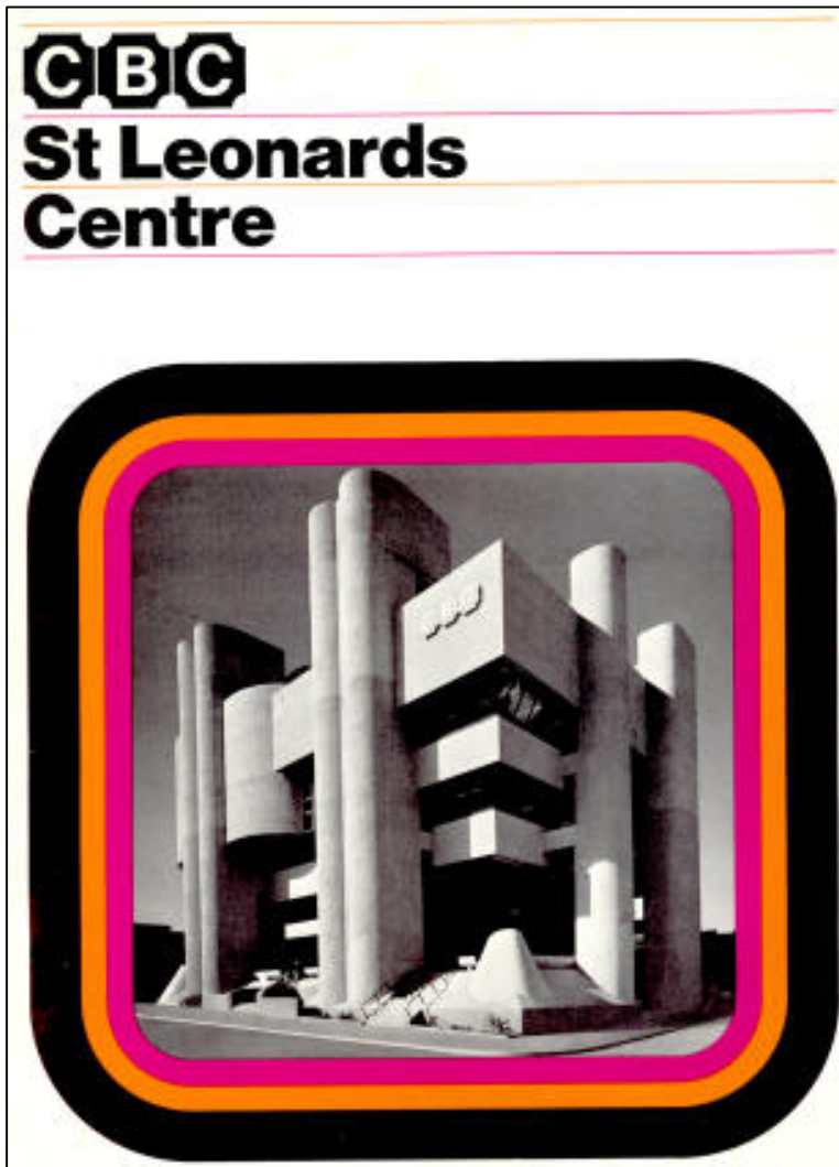
Figure 11: The Commonwealth Bank Brochure that accompanied the opening of the St Leonards Centre in 1972.

The below photographs provide excerpts from The Commonwealth Bank Brochure that accompanied the opening of the St Leonards Centre in 1972.