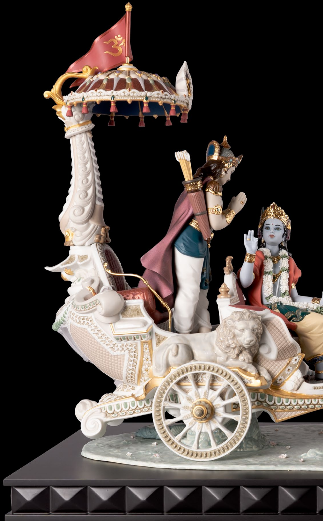
GITA SAAR 01002017 65 x 86 x 42 cm 25½" x 33¾" x 16½" Limited edition of 299 pieces