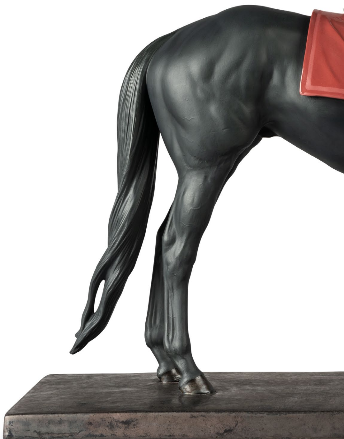
ENGLISH PUREBRED 01009469 44 x 56 x 17 cm 17¼" x 22" x 6¾"