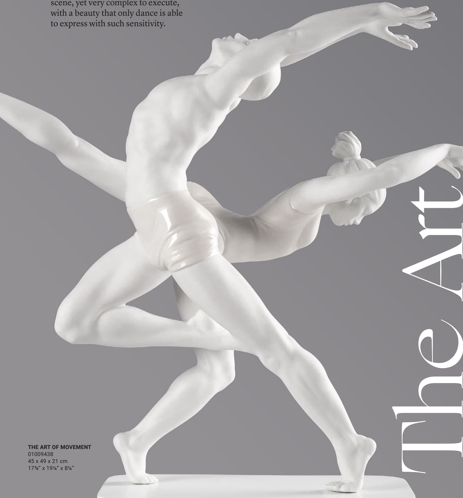
THE ART OF MOVEMENT 01009438 45 x 49 x 21 cm 17¾" x 19¼" x 8¼"

Certain Lladró creations are timeless because of their themes, their expressiveness and their high technical quality. That is the case of this captivating creation dedicated to the art of movement . A harmonious scene, yet very complex to execute, with a beauty that only dance is able to express with such sensitivity.