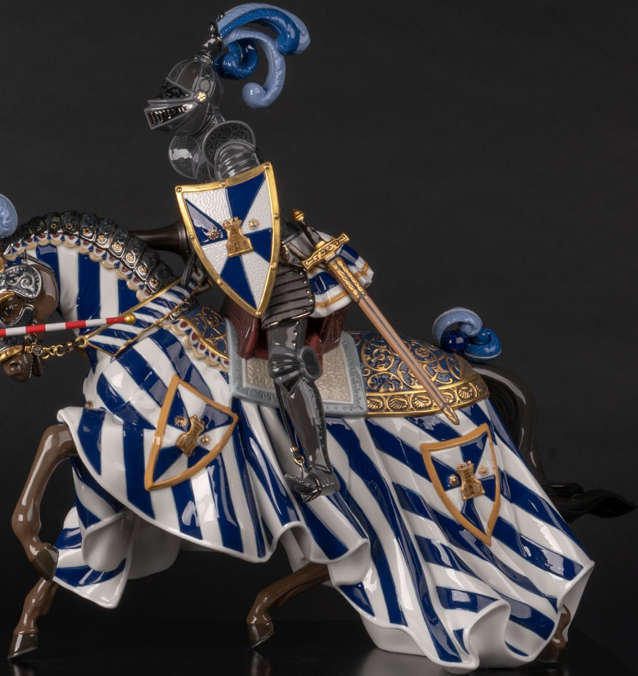
MEDIEVAL TOURNAMENT 01002018 59 x 106 x 42 cm 23¼" x 41¾" x 16½" Limited edition of 300 pieces