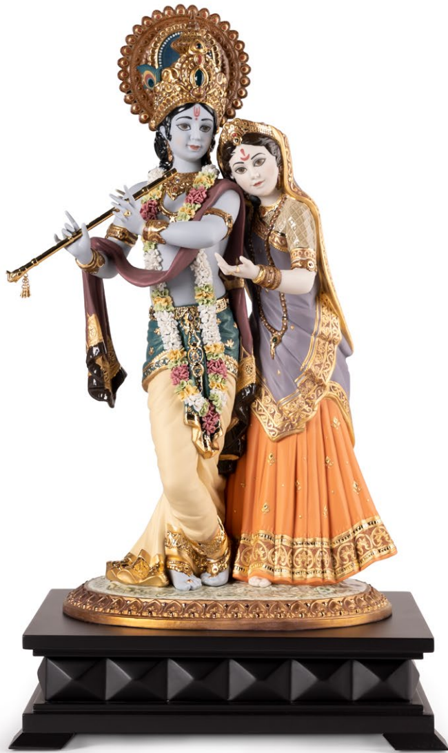
RADHA KRISHNA 01002015 53 x 31 x 27 cm 20¾" x 12¼" x 10¾" Limited edition of 720 pieces