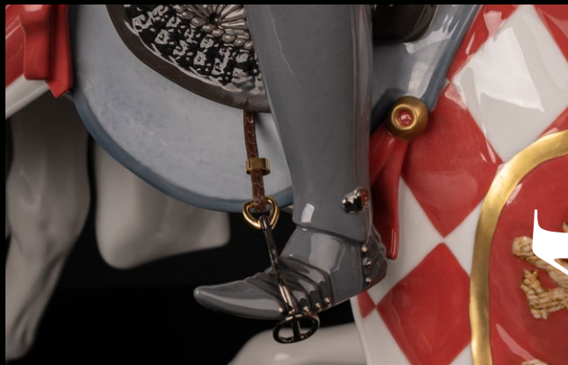
MEDIEVAL TOURNAMENT 01002018 59 x 106 x 42 cm 23¼" x 41¾" x 16½" Limited edition of 300 pieces