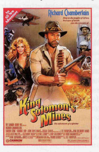
Movie poster for King Solomon's Mines (1985).

cowboy, the moral force central to the American imagining of the taming of the West.7 In these films, the archaeologist is a secondary character used to facilitate the excitement. The same is true of other genres. It is a detective, not a cowboy who investigates the murder of the archaeologist, in Phantom of Chinatown (1940). Likewise, John Wayne is enlisted to protect archaeologists in Legend of the Lost (1957). In 1977's March or Die, the Foreign Legion must protect a team of helpless archaeologists from a murderous Arab