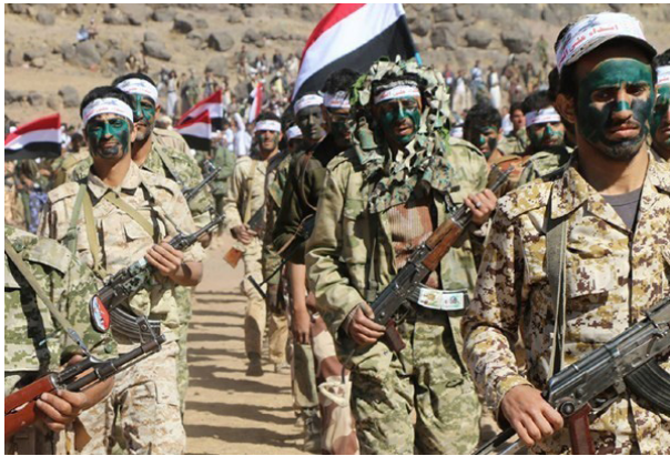
Figure 5: Hezbollah runs a covert support mission for Houthi militiamen fighting the Saudi-led coalition in Yemen ( http://en.alalam.ir/news/1941256 ).

was composed of seasoned veterans and was responsible for advising, training and coordinating the Hashd Shaabi, the 130,000-strong coalition of government-sanctioned, Iran-backed Shiite militias. Hezbollah continues to maintain a limited presence in Iraq of perhaps no more than 500 personnel and its operational activity does not appear to have changed significantly since 2014 and is focused on the anti-ISIS campaign.