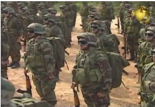
Figure 3: Still from a 2014 Hezbollah propaganda video shows fighters on parade at a training camp in the Bekaa Valley. Hezbollah's manpower has increased substantially since the 2006 war with Israel.

domestic political process since 2008 has been beset by successive waves of paralysis and stalemate. Hezbollah's opponents have come to accept that they have little leverage against a party that carries with it an implicit threat of violence if its interests are challenged.