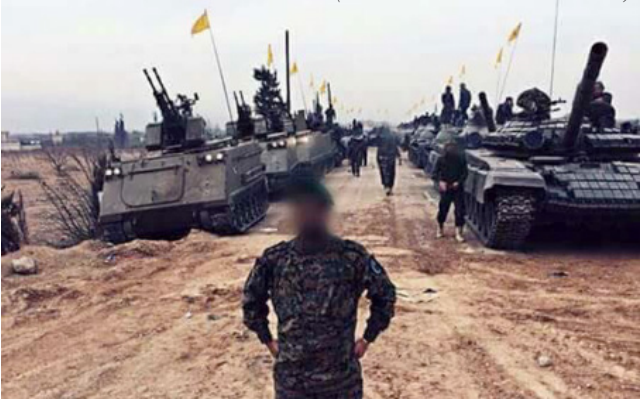
Figure 4: In November 2016, Hezbollah held a parade in the Syrian town of Qusayr, five miles north of the border with Lebanon, to show off its new armored unit. The vehicles included armored personnel carriers, T-55/T-72 tanks and self-propelled artillery.

Hezbollah’s lessons learned in Syria sit uncomfortably with Israel. The Syria experience, as well as the acquisition of advanced weaponry over the past 10 years, has turned Hezbollah into “currently the gravest military threat facing Israel,” according to Israel’s influential Institute for National Security Studies in its annual strategic assessment for 2017. 7