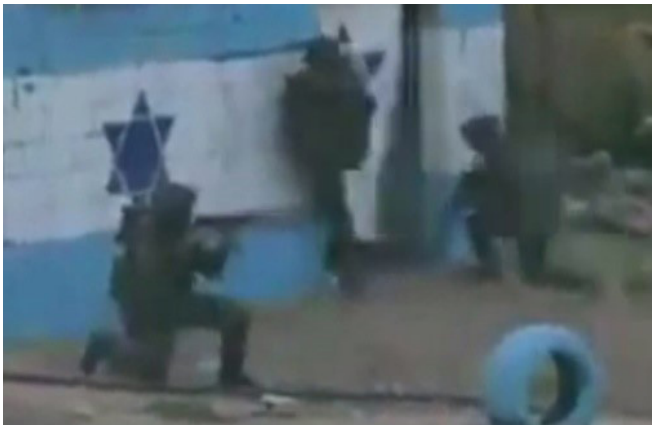
Figure 2: A still from a 2014 Hezbollah propaganda video showing fighters storming “Israeli” houses filmed at an urban warfare training facility in the eastern Bekaa Valley. The video provides further confirmation that Hezbollah intends to infiltrate Israeli territory in the next war with Israel. (YouTube).

in south Lebanon. Having been raised in such an atmosphere, fully joining the party at 18 years old—the traditionally required age to engage in combat—is often a natural progression.