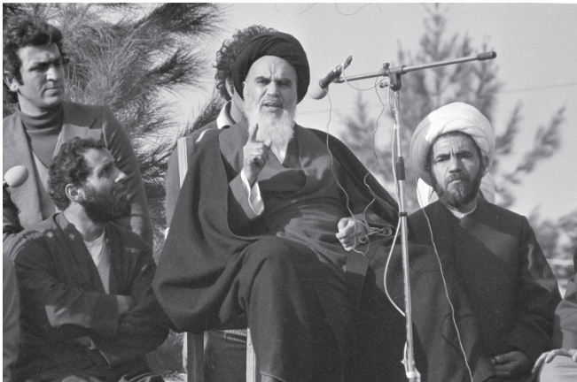
Figure 1: Ayatollah Ruhollah Khomeini, the first supreme leader of the Islamic Republic of Iran and the articulator of the wilayat al-faqih theory. (Press TV).

is the daily spiritual struggle within the carnal soul to overcome the vices and temptations of the human condition to achieve divine knowledge, spiritual harmony, and love. Adhering to the "greater jihad" then paves the way for pursuing the "lesser jihad," which is split into "offensive" and "defensive" jihads. The former permits Muslims to invade other countries and subjugate their citizens with the justification that Islam is the one true religion.