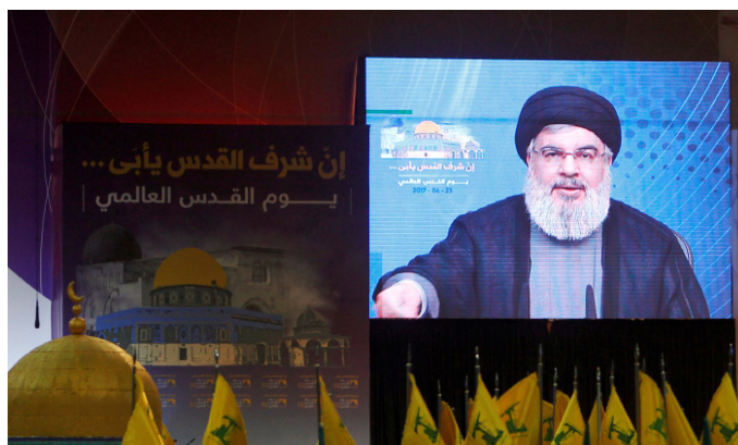
Figure 6: Sheikh Hassan Nasrallah, Hezbollah’s secretary-general, giving the Quds Day address on June 23, 2017 during which he warned Israel that tens of thousands of volunteers could assist Hezbollah in a future war with Israel.

Israel that there would be no “red lines” in the next war, and threatened to strike Israel’s nuclear reactor in Dimona and the ammonia plants in Haifa if Israel attacks Lebanon. On June 23, Nasrallah additionally warned that a war with Israel could “open the way for thousands, even hundreds of thousands, of fighters from all over the Arab and Islamic world to participate— from Iraq, Yemen, Iran, Afghanistan and Pakistan.”