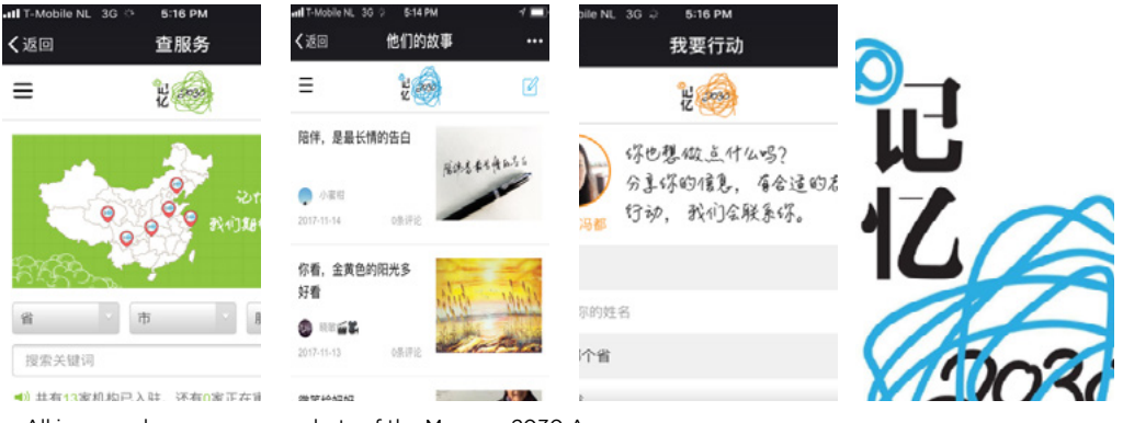
All images above are screen shots of the Memory 2030 App

As noted, the Memory 2030 app helps subscribers share stories, disseminates Alzheimer's related knowledge and resources, helps locate professional dementia care organizations, and encourages organizations to join the alliance and register to share information. By the day of the premiere, 10 organizations had already signed onto the app. Today the app hosts 22 organizations.