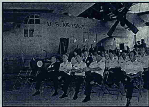
Rollout of HIANG C-130H-3 at Marietta, Georgia

assembly line in Marietta, Georgia on August 18. This is the first time the Hawaii Air National Guard has received a brand new aircraft. The newest version of the venerable C-130 was first flown to Cheyenne, Wyoming for an acceptance inspection. It is scheduled to arrive in Ha-