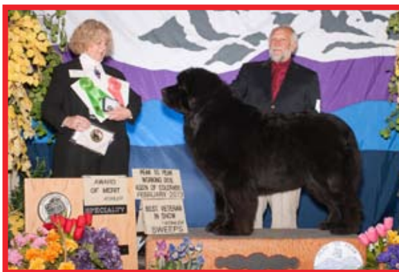
Award of Merit GCH Ch Bruin's Onyxbay Premonition RA, CD