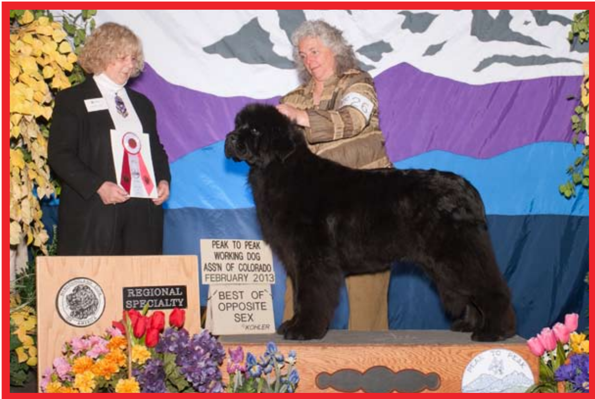
Best of Opposite Sex Specialty Ch Dalken's Boatswain Nessa