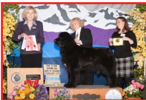
Select Bitch Ch Blackwatch Blk Diamond Heavenly CD, RN