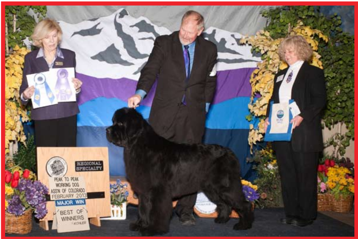
Best of Winners Bee Creek's State of the Union RN, BN