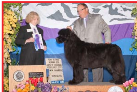
Select Dog Ch Darbydale's All That and More