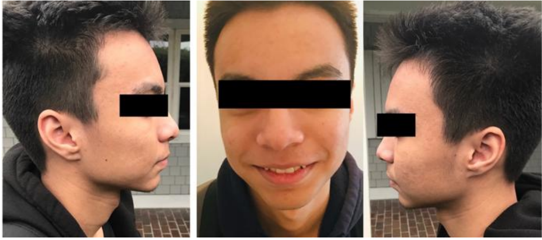
Figure 6: Photo after 4 months of treatment Acne fully resolved

Volume 10 Issue 2, February 2021 www.ijsr.net