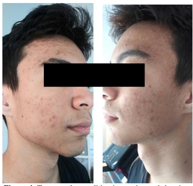
Figure 4: Two months-condition improving and showing melanin deposits