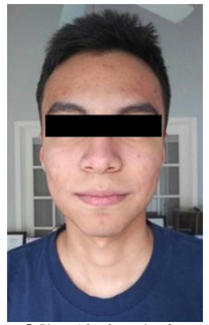
Figure 5: Photo After 3 months of treatment