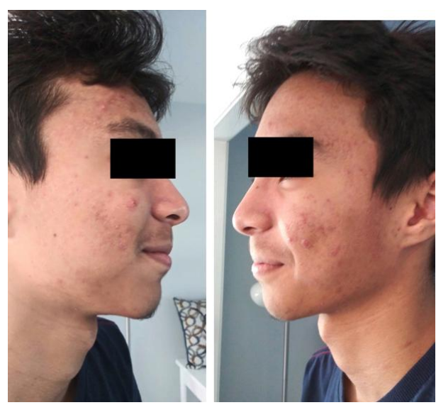
Figure 3: Photos showing condition before start of treatment

Accutane (isotretinoin). Weekly follow-ups were scheduled for observation. After the first week of 100,000 IU/day showed no adverse effects, the dose was increased to 200,000 IU/day for the duration of the trial. The patient developed dry, chapped lips for which a lip balm offered relief. In addition, the patient developed observable redness in the face at the upper cheek/nose area, which culminated after one month in dry, flaky and peeling facial skin. These side effects appeared to resolve by 2 months. This condition was left alone and not disturbed with any facial creams or moisturizers because immediate concomitant improvement in acne began to be observed after 1 month. Also, at around 2 months, melanin deposits were evident and began to replace areas of acne and previous pustules. After 3 months, the overall condition was much improved, but the treatment plan was continued to help ensure a lasting result with no relapse. After 4 months the treatment was concluded with complete remission of the condition. At 10 months post treatment initiation (6 months after treatment completion), the patient's face remained completely free of acne. Photographic evidence for the study follows: