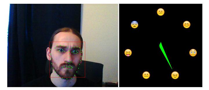
Fig. 4: The GUI showing anger emotion

The server application uses the weights generated by training on all data, which subjectively gives the best results for a person facing the camera. The provocation of fear emotion was hard to detect which can be due to an insufficient amount of training data, the subjectivity of the supervising annotators or a sampling bias, since most of the training data were acquired by using the Google image search API without stratification. With an average frame rate of 26 per second on an Intel Core i5 3450 CPU, the performance can be considered satisfactory. Although it would have been desirable to run preprocessing and classification on a single machine, the clientserver solution alleviates the need for expensive graphics cards in every unit running the software. The user interface can be seen in Fig. 4.