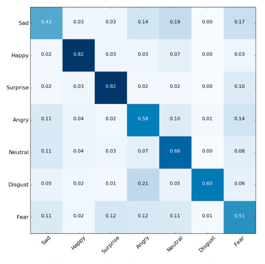
Fig. 3: Confusion matrix of the basic emotions in FER

In contrast, FER contains grayscale images, 48x48 pixels in size. Despite the much lower resolution and the missing color information, the network managed to detect very good features, which impressively demonstrates CNN's generalization ability.